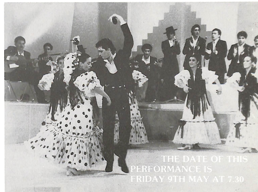
THE DATE OF THIS PERFORMANCE IS FRIDAY 9TH MAY AT 7.30

WHEN THE KING OF SPAIN JUAN CARLOS TRAVELS TO ROME NEXT MONTH ON HIS WAY TO DAMASCUS HE WILL TAKE WITH HIM, AS USUAL, HIS CIUDAD DE SEVILLA TROUPE WHICH NUMBERS ELEVEN ARTISTS. WHENEVER THE KING GIVES A BANQUET THEY ENTERTAIN. ON THIS OCCASION THEY HAVE RECEIVED HIS MAJESTY'S PERMISSION TO ACCEPT THE MANOEL THEATRE MANAGEMENT COMMITTEE'S INVITATION TO GIVE A PERFORMANCE IN MALTA BRINGING THEIR OWN COSTUMES AND MUSIC