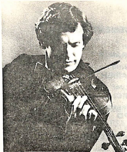
EUGENE FODOR, Violin

Capriccios 13, 14, 9, 17, 24 Nicolo Paganini