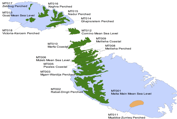
Figure 1: Groundwater bodies found in the Maltese Islands (Copyright ©2014 Malta Resources Authority; reproduced with permission).

in the mid-1990s, which was approximately 7.0 \text{ kWh/m}^3 , due to the greater amount of water produced to meet the demand. In comparison, the specific energy consumption for groundwater is 0.8 \text{ kWh/m}^3 . For the production of treated effluent from municipal wastewater, the Sant'Antnin treatment plant in Marsascala, Malta, uses 1.3 \text{ kWh/m}^3 (NSO, 2014). Figure 2 shows the electricity consumption of water production sources, with a lower trend emerging as investment in energy-efficient technologies, particularly in RO, proved successful.