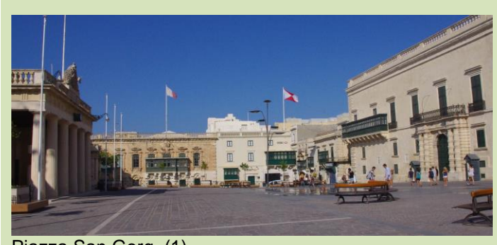
Pjazza San Gorg (1).

<u>Pjazza San Gorg:</u> Pjazza San Gorg is along Republic Street, halfway between City Gate at one end of Valletta and Fort St. Elmo at the other. On one side of the piazza is the Grandmasters Palace, whereas on the other side is the Main Guard. Both are of historic and architectural importance. Until just a few years ago, the piazza was used for parking. It was not uncommon to see tourists walking in between parked cars to take photos of the Sette Giugno monument, which was within the piazza. Something which was totally unacceptable from a tourism point of view, was brought to an end in 2009 thanks to pedestrianisation.