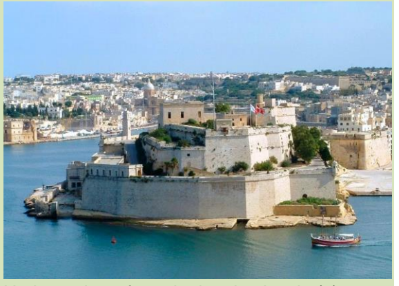
Harbour views from the bastion level. (2).