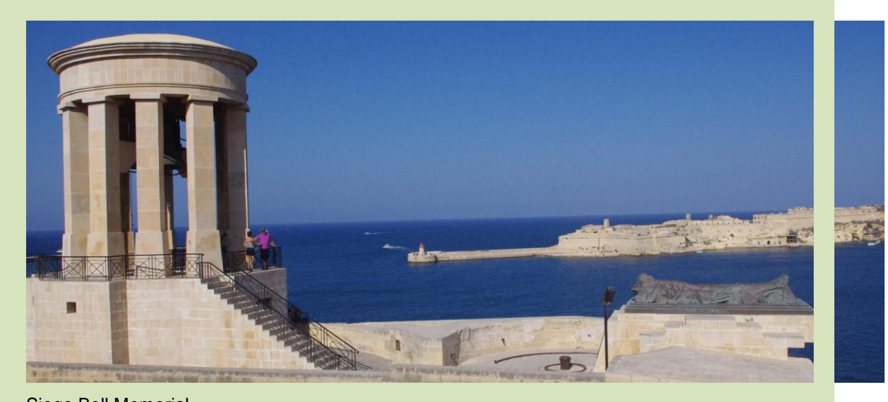
Siege Bell Memorial

Also below, a bronze catafalque overhangs the bastion parapet, symbolising the burial of the corpse of the unknown soldier at sea. The overall design and layout of the memorial is replete with narrative, with the 'meaning' being reinforced by the 'physical form'.