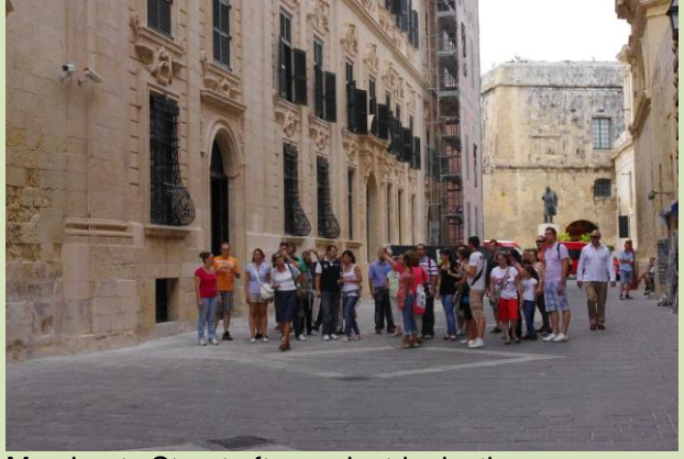
Merchants Street after pedestrianisation

Merchants Street: Merchants street runs the entire length of Valletta from Castille Place to lower Valletta. Until 2007, most of the width of the street was taken up with tarmac for moving traffic and parking. The street is close to and runs parallel to Republic Street which is Valletta's main shopping street. Its commercial potential, however, was not being used to the full because of the ever present traffic. Pavements along the side were usually crowded making walking difficult. Merchants Street boasts several historic buildings and it was not uncommon to see groups of tourists crowding the pavement while listening to the tour leader. All that changed with pedestrianisation.