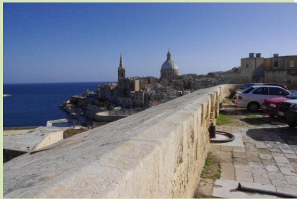
Vantage points used as car park

With appropriate redesign including increased space for pedestrians, Castille Place has the potential to be one of the finest urban spaces in Valletta, without unduly compromising its function.