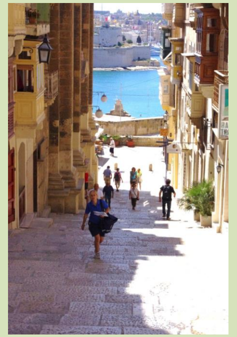
Sea views from the inner streets (1)