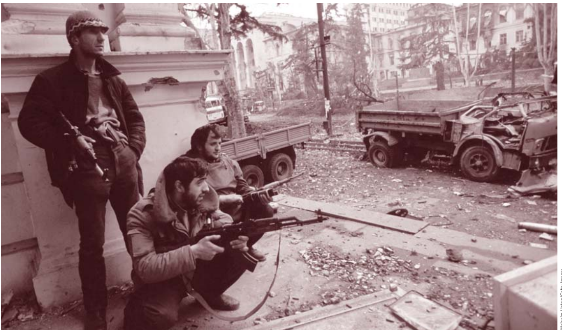
Armed men aim into a square in Tbilisi, Georgia, in December 1991

The bulk of weapons in the hands of all of the warring parties in Georgia came from internal holdings, mainly from the substantial ex-Soviet military presence on Georgian territory. In the early phases of the conflict (between 1989 and 1991), however, few small arms and light weapons were leaked from Soviet military stockpiles. Instead, the main sources were non-military in nature, namely police and postal guards, the so-called Voluntary Society of Supporters for the Air Force and Navy (which normally provided military training to civilians), and communist youth organizations. Quantities were small: tens, rather than hundreds or thousands, of guns. Another significant source during this period was personal holdings such as Second World War Mosin rifles.