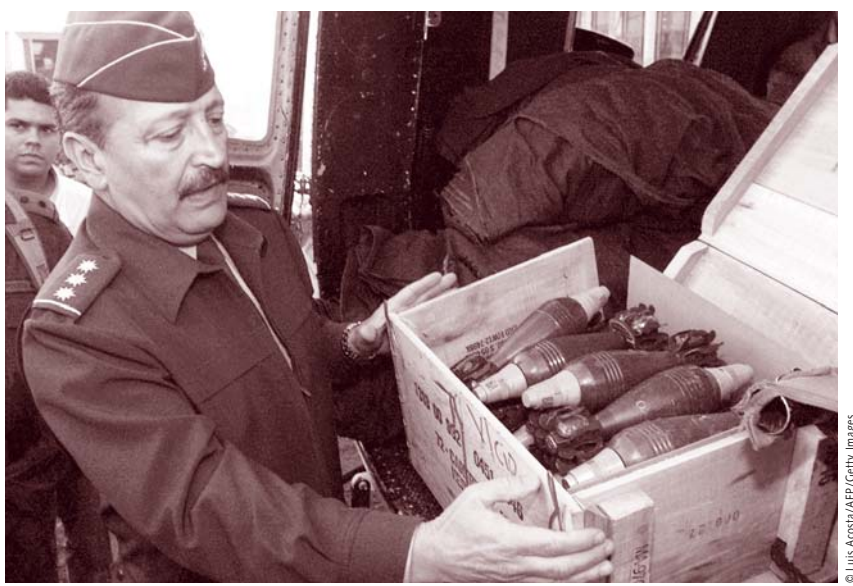
A police director inspects a box of mortars seized from paramilitary groups in northern Colombia in July 2000. The arsenal comprised automatic guns, mortars, machine guns, and almost 100 grenades.

Second, with the end of the cold war, large amounts of small arms became available on the wider Latin American illicit markets; in the 1980s, the Soviet Union and the United States had shipped some of these weapons—many of which originated in the former Soviet bloc—to El Salvador, Honduras, and Nicaragua (bound for governments or insurgents). A study published by the RAND Corporation in 2003 asserts that 'thousands, or even tens of thousands, of weapons' shipped by the United States to Central America at various times 'likely remain in caches throughout [the region]' (Cragin and Hoffman, 2003, p. 12). A much-publicized case of a transfer involving cold war-era weapons was the November 2001 shipment of 3,000 Nicaraguan-sourced AK-47s and five million rounds of ammunition to the AUC using forged documentation from Panama (OAS, 2003). Approximately one-third of all small arms trafficked into Colombia between 1998 and mid-2001 was reportedly sourced in El Salvador, Honduras, Nicaragua, Panama, and, to a lesser degree, Costa Rica (Cragin and Hoffman, 2003, p. 21). Not all of this trafficking was in cold war weaponry, however: newer small arms originated in the Caribbean, Mexico, and the United States (Cragin and Hoffman, 2003, p. 23).