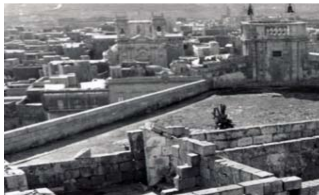
1937 Aerial view of Rabat's historic core: St George's dome and western aisles were still under construction. St Joseph's dome and belfry are also visible.

chapels erected at the turn of the sixteenth century inside the said matrix by the upper crust of Gozitan society for burial purposes. 15 The medieval matrix compound was severely damaged by an earthquake in January 1693 and was successively rebuilt between 1697 and 1711 on an exquisite plan by the Maltese architect Lorenzo Gafa (Bezzina, 1985: 41).