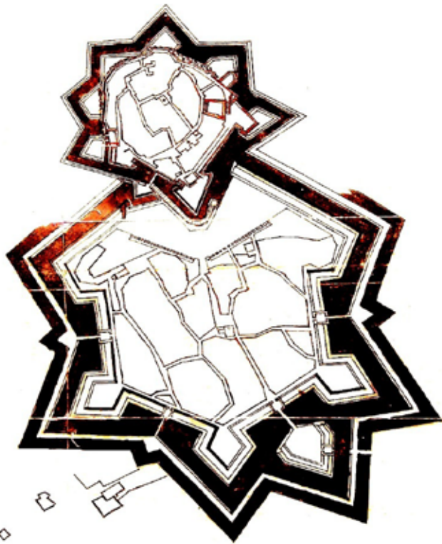
Valperga's refortification proposal.

and Rabat's historic core was to remain devoid of buildings, while access to and from the Castello was to retain the existing arrangement except for the re-routing of the approaching passageway's lowermost section.