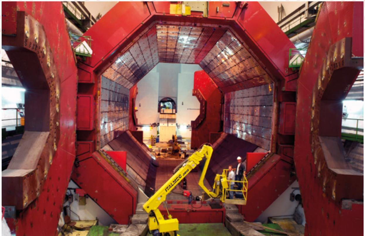
Construction of the ALICE chamber (2003).

easily to replace hardware. 'If you want to have access in HMPID, you have to remove all the other detectors. It's practically impossible. Logistically, they can only take it out in the shutdown,' says Casha. Magri confirms, noting how during his time at CERN he saw machines that are still made up of discrete components. 'This is an environment where they can't afford to stop processes, to stop working. It might be old tech but if they work, they work,' he states.