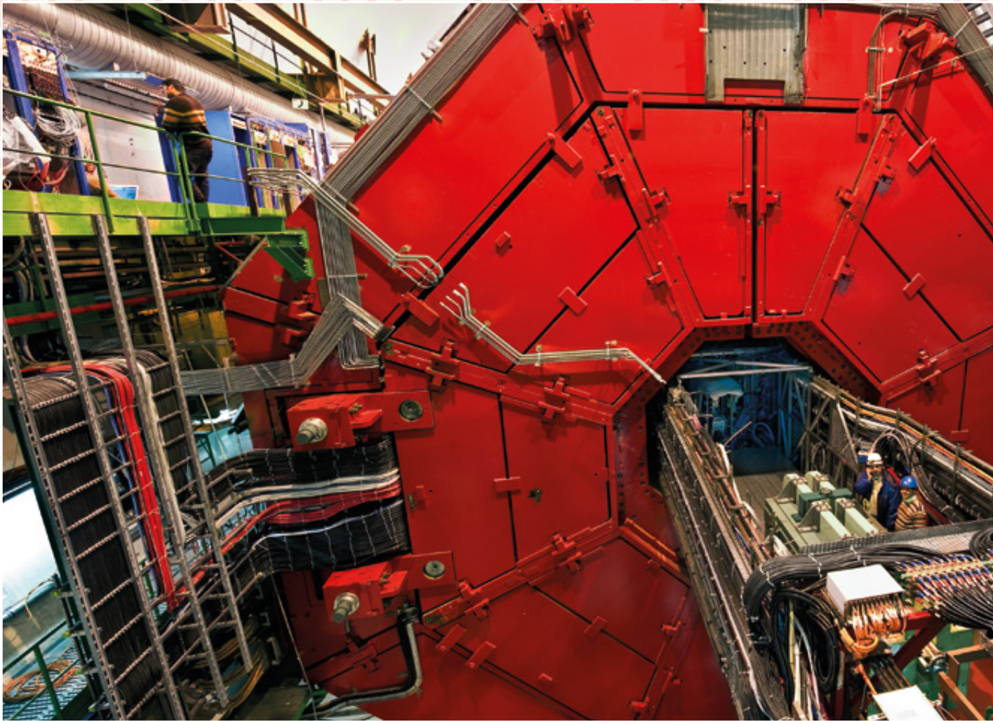
The ALICE chamber.

that will synchronise the whole thing.' Picking up the camera analogy once more, Gauci clarifies, 'This is one large camera made up of many small ones. They need to be triggered at different times to go off at the same time, when everything is in place. This is my job.'