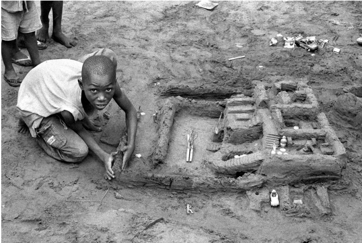
Figure 1. Kinzénguélé, 2003, Moukondo, Brazzaville

Looking down at an African boy building a sand castle, the reader might wonder what the editors wish to convey with this image for this special issue on utopia. And indeed, does such an image not feed into the common stereotypes on which charities and humanitarian organisations play to foster pity for a continent trapped in cyclical poverty? A viewer's assumption might easily be that the picture was taken by a white photographer charmed by the sight of what is then framed as proof of the legendary resourcefulness of poor black children satisfied to play with mud and the leftovers of mass production. But if our aim is not to join the concert of voices singing the beautiful creative simplicity of deprived childhood, along with the construction of a condescending gaze on those who are viewed as needing “our” help, why, then, did we choose this particular cover image?