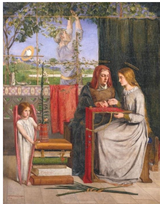
Figure 4 (above): The Girlhood of Mary Virgin (1848-9)

The simplicity of the room allows the viewer to directly notice the unusual hints left by Rossetti in the painting. The first of which is how disturbed Mary looks. She seems as though she has just been awakened from her sleep and is terrified. At first glance, some viewers may construe that Rossetti is trying here to show a Mary who is reflecting on the prospects of a life taken away from her by being ordered to carry the child of God. Part of this is certainly evident in the painting, but there is more to it than that. Upon a closer look, Mary's absent gaze is fixed upon the lily which Gabriel is holding. The stem of the lily seems to be directed toward Mary. If the lily is a symbol of virginity, and it's the stem of the lily rather than the lily itself that is pointing toward Mary, then this is a disturbing indication that Gabriel has plucked Mary's virginity. There are several pieces of evidence in the painting to support my incriminating reading of Rossetti's Gabriel. First, Gabriel is depicted in an androgynous form combining the masculine with the feminine in his figure, like Salomé and Mariana. Second, he does not have wings here, which adds to his human demeanour. Third, his feet are