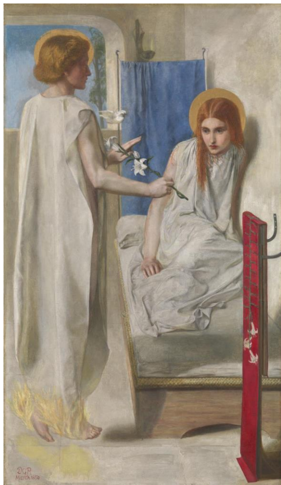
Figure 3 (left): The Annunciation (1849-50)

the main decorations of the room. The rest of the room is mainly in white, and its tones at first sight appear as a symbol of purity and virginity complementing the white lily, indicating that this is the holy sanctity of Mary's bedroom. 22