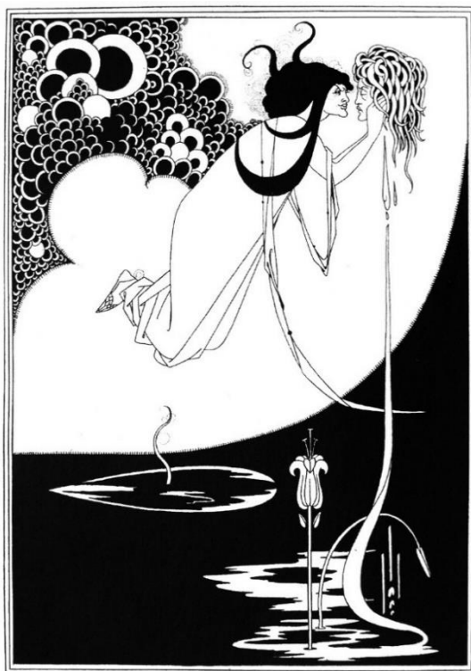
Figure 1: The Climax (1894)

Aubrey Beardsley's The Climax (1894) is one of his illustrations of the English edition of Oscar Wilde's Salomé . Beardsley's unclassifiable style is considered by some critics as Japanese grotesque, by others as a late development of the aesthetic movement. Beardsley himself, however, has never put himself under any category and the majority of his critics view him as a category of his own. 2 In his letters, we get glimpses of Beardsley's development of his style: 'I struck out a new style and method of work which was founded on Japanese art but quite original in the main'. 3 At another point he calls it 'grotesque', 4 he also refers to it as 'Japonesque'. 5 It is obvious that his art was influenced by Japanese woodblock artists to which he was exposed through exhibitions in London and via various late nineteenth-century publications. 6 The Climax is one of the masterpieces of his unique black-and-white grotesque style. Challenging the new woman stereotype of a studious, unattractive female, The Climax depicts a euphoric and sexually elated Salomé, holding onto John the Baptist's bleeding head, her reward for performing the erotic dance for Herod. Behind her, black and white clouds seem