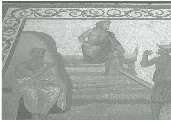
Figure 1: A mosaic in the Kos Museum depicting Hippocrates, the father of medicine (left) awaiting the arrival of Asklepieion, the Greek God of Medicine (centre) at the Port of Kos.