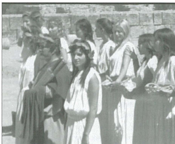
Figure 4: The re-enactment of the taking of the Hippocratic Oath among the ruins in Kos of the Temple of Asklepieion, the Greek God of Medicine.