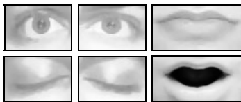
Figure 2: The six templates considered.

After successful face and facial feature detection, eye and mouth states are determined in every frame using the correlation coefficient template matching method. Due to the required computational complexity of this method, the reference images are restricted to the same search regions as those used for the facial feature detections, with each region being compared to two corresponding open and closed instances. The six grayscale equalized templates adopted in this work are illustrated in Figure 2.