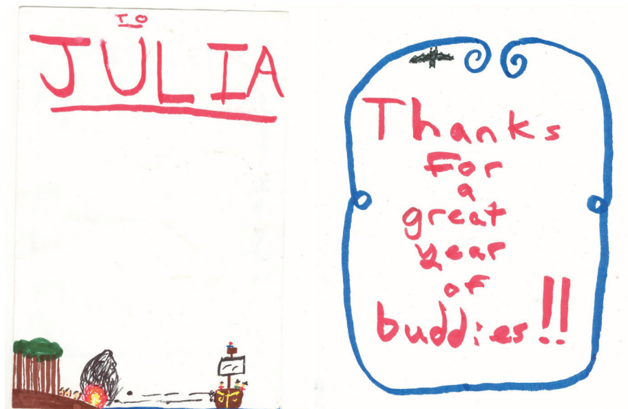
Figure 2. Front view of card. Copyright 2011 by Rebecca Sockbeson. Reprinted with permission (Sockbeson, 2011, p. 15).

As a kindergartener, my daughter could have been a pirate. However, she refused because, as she explained, she was a "for real" Indian, and that game was "not okay because it liked to kill Indians." Note that the younger children – those with the smallest bodies and the least power - played the Indians. Around the same time, my daughter received a card from her fourth grade-reading buddy (see Figures 2 & 3). On the front of the card was an intricately drawn picture of a ship from which light peach colored figures with yellow hair shot at a group of brown, black haired figures on the shore. Immediately in front of the brown skin people was a large bomb-like fire.