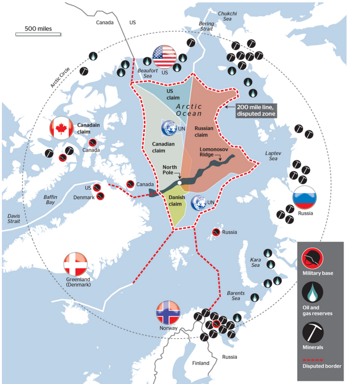
Overlapping Arctic claims and resources. (TheTimes.co.UK)

Under the provisions of UNCLOS, states have ten years after treaty ratification to claim and extend territorial limits beyond the 200-mile Exclusive Economic Zone provided by the convention. Russia ratified UNCLOS in 1997 and had until 2007 to apply for a concession. Whilst Russia has always looked at the Arctic as an integral part of Russian identity (indeed until the collapse of the Soviet Union, Moscow maintained a large