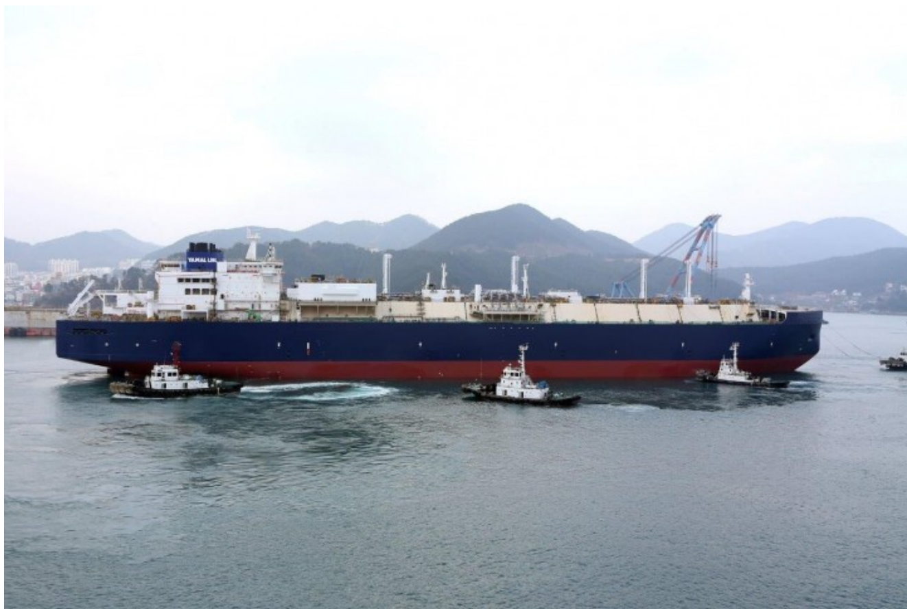
SCF Yamal/ Christophe de Margerie, the first Arc-7 Ice Classed LNG carrier.

The development of LNG and oil carrying ice-capable tankers is an area of particular economic interest for Russia. In this area, Russia is collaborating with Daewoo Shipbuilding and Marine Engineering in South Korea and an international consortium for the construction of the first Arc 7 ice-classed LNG carriers. The aim is to reliably deliver the LNG produced from the Yamal LNG project in the Yamal Peninsula .