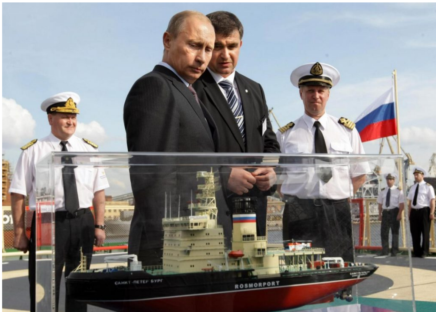
Russian President Putin views a model of Project 21900 icebreaker ST PETERSBURG

Russia has as many as 40 icebreakers, both nuclear powered and conventional (see table below). Although some of these vessels are relatively old, with many of them built during the Soviet era, Russia also has various new designs under construction. In total, there are currently some 14 icebreakers of various types being built in Russia.