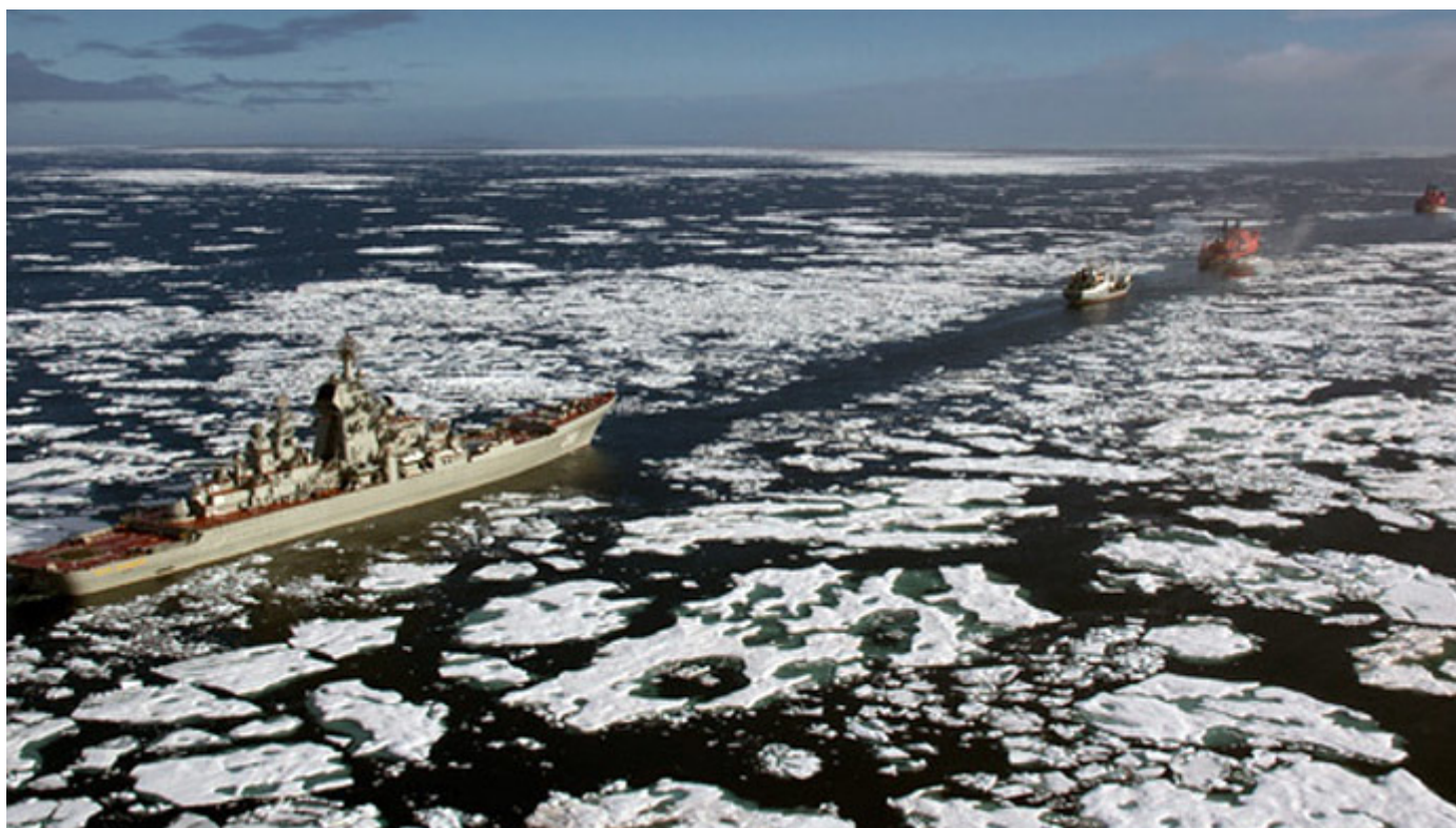
A Russian Northern Fleet warship transits Arctic waters with icebreaker escort in 2013.

All these elements are under the command of Russia's Arctic Joint Strategic Command, recently formed in December 2014. This command is responsible for the training and operational employment of Russian assets in the region; including all combat units, radar stations, airfields and support units. Northern Fleet units based at Kotelny Island also fall under the authority of this command.