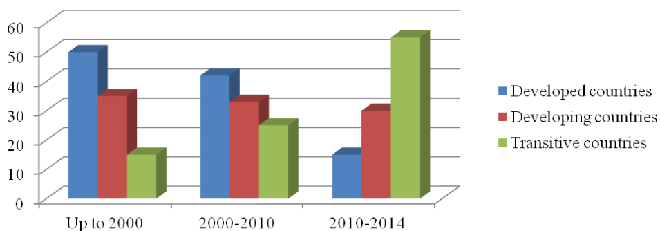
Fig. 1 Distribution of cluster initiative as to time of emergence

Informational and analytical basis of research is statistical information on dynamics of development and modern state of cluster initiatives in Russia. Statistics of distribution of cluster initiatives as to time of emergence (Fig. 1) reflects the gradual transition of initiative from developed countries to developing and transitive countries – countries with transitive economy, which include modern Russia.