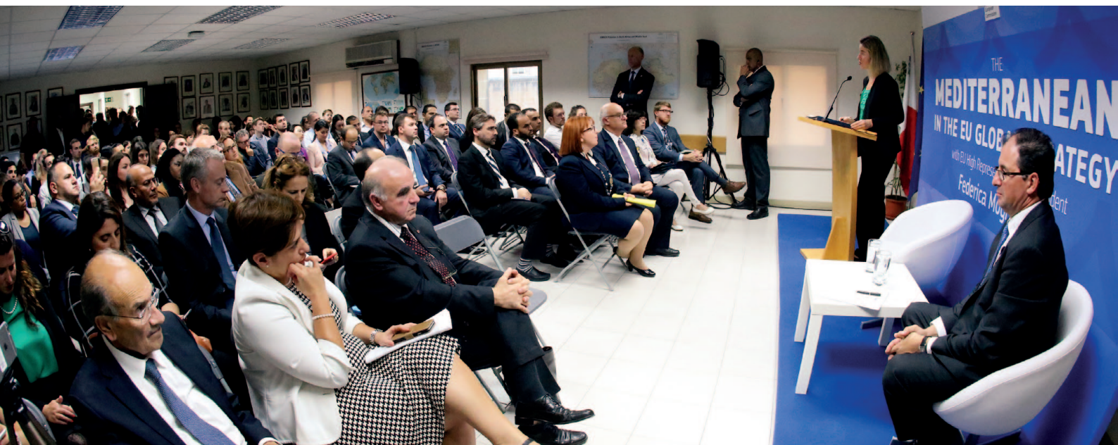
Below: H.E. Ms. Mogherini addressing the gathering.

The text of the lecture is also available on the MEDAC website at https://www.um.edu.mt/__data/assets/pdf_file/0016/303163/MedAgenda25-FedericaMogherini.pdf