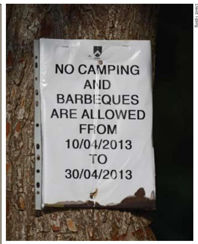
No fun. One Local Council even prohibited people from using a campsite for the entire duration of last year's spring hunting season.

Maltese Islands every year become, for five months in autumn/winter and another three weeks in spring, potential killing grounds for 10,000 hunters to roam and shoot birds. For almost half the year, more than half the land area of the Maltese Islands becomes the virtual property of bossy armed men, free to litter the countryside with lead pellets and dead birds.