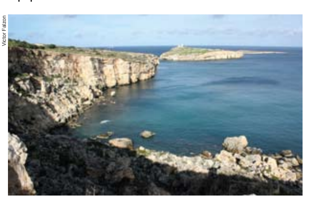
Old haunt. In Malta the peregrine hunts almost exclusively along the coast and at sea. In the past, peregrines probably nested in places such as Rdum il-Bies, pictured above.

Whatever the peregrine's former status, however, one thing is certain: disturbance from the ever-growing human population and direct persecution by hunters and collectors took their toll, and by the mid-20th century just one or two pairs of peregrines were breeding regularly.