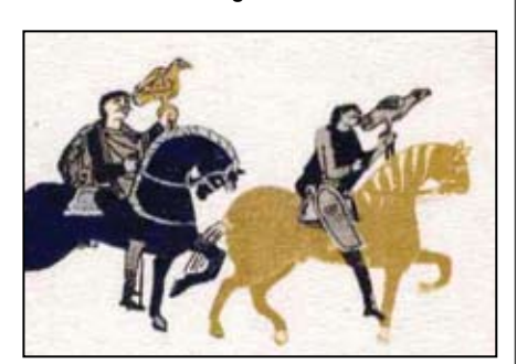
Prized by the nobility. Falconry was popular in medieval times, especially with the aristocracy.

The peregrine falcon has always been considered one of nature's supreme hunters. Historically, the peregrine was a favourite among falconers due to its