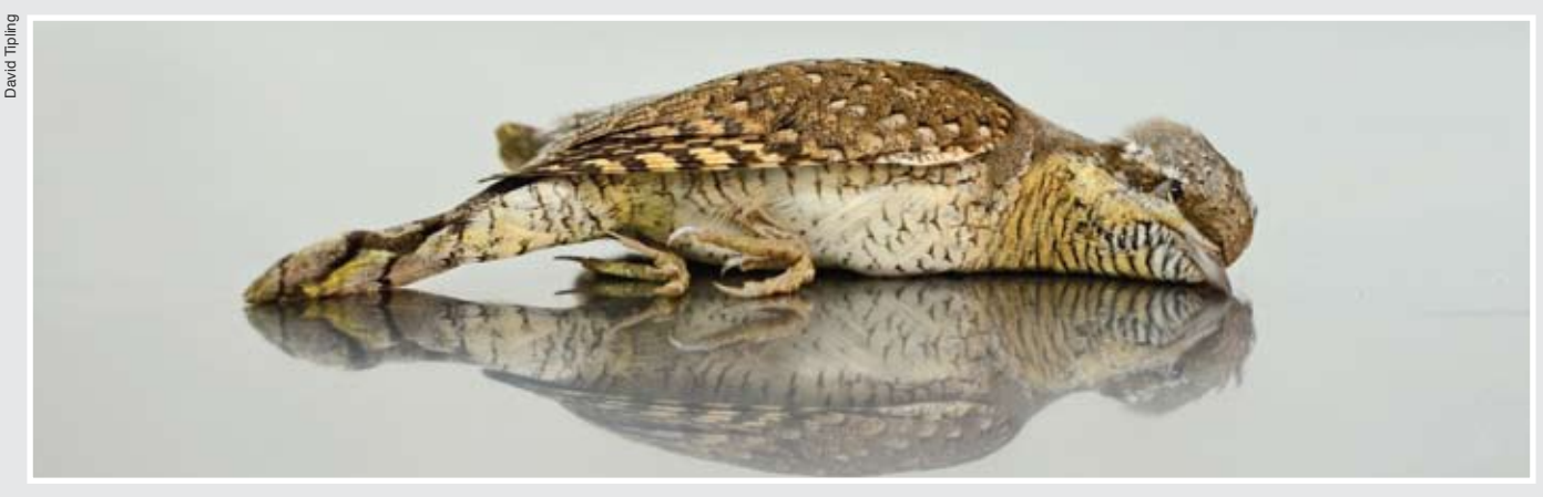
End of the road. A dead wryneck, a protected species shot down by a hunter in spring last year. A successful referendum will reduce this wanton destruction.

that can be seen in spring. Walkers and ramblers could explore the countryside and families could have picnics without feeling they were in a war zone.