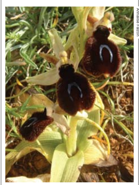
Endemic. The Maltese spider orchid is an endemic species that occurs at Majjistral Park.

Spring is also the best time to see and hear some of Malta's breeding birds, such as the blue rock thrush (Malta's national bird), the male of which perches on rocks singing to establish its territory and attract a mate. The park is also home to significant numbers of