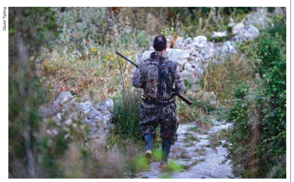
Terminator. With virtual impunity and with even less restrictions than in the previous year, a hunter sets out early on a spring morning to kill whatever takes his fancy.

The spring hunting season usually lasts about three weeks in April. During this time nearly 10,000 hunters occupy the countryside, making much of it a virtual no-go area for families, ramblers, tourists and anyone else who might want some fresh air. Spring is the best time of year to go outdoors, but bullying and harassment