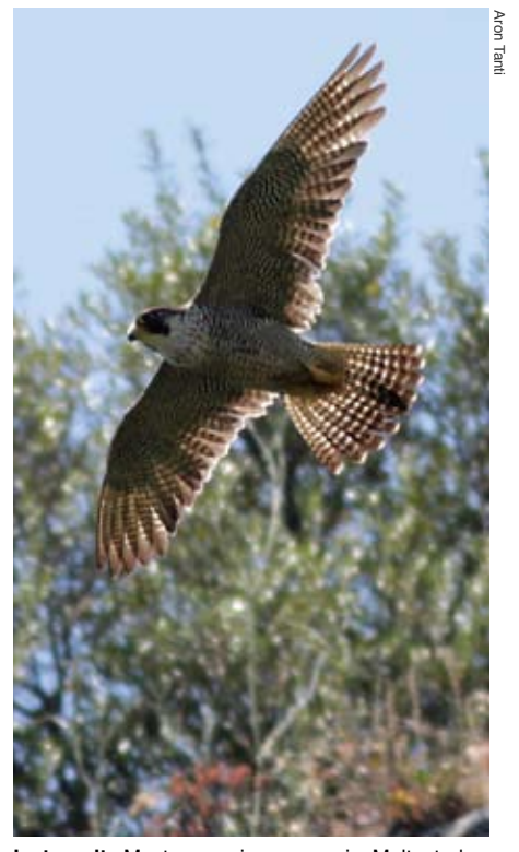
In transit. Most peregrines seen in Malta today are passage birds migrating between Europe and Africa.

The race that breeds in southern Europe and the Mediterranean basin is