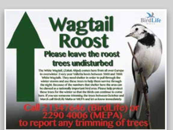
Do not disturb. The sign put up by BirdLife at the wagtail roost site in Valletta.