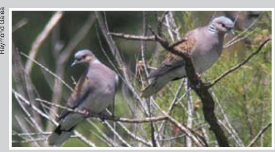
Prize target. In Malta, hunters are still given free rein to kill turtle doves. A referendum will put an end to this.