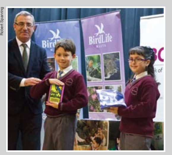
Standing proud. Students from Haż-Żabbar Primary show off their Gold Award and Blue Banner to Education Minister Evarist Bartolo and all present.

The winter wagtail roost in Great Siege and St John Squares provides a fascinating wildlife watching opportunity for anyone visiting Valletta at sunset between October and March. In January, more than 7400 white wagtails were counted in Valletta by BirdLife birdwatchers and members. Valletta is the only known roost site for these small insectivorous birds in mainland Malta. In 2006 the city was designated a National Important Bird Area specifically because of this roost. But in 2012 the ficus trees that form the roost were subjected to unauthorised pruning right in the middle of the winter, displacing thousands of the birds. BirdLife reported the incident to MEPA, and to prevent a similar disaster this year, it installed signs informing the public of the trees' importance for the birds, and why pruning needs to be carried out sensitively, outside the winter months, and only when necessary.