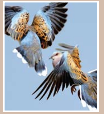
The turtle dove would breed regularly were it not ruthlessly hunted in spring.

© 2014 BirdLife Malta. All rights reserved. Reproduction in whole or in part without written permission from the publisher is prohibited. All information reported in this publication is correct at time of going to press.