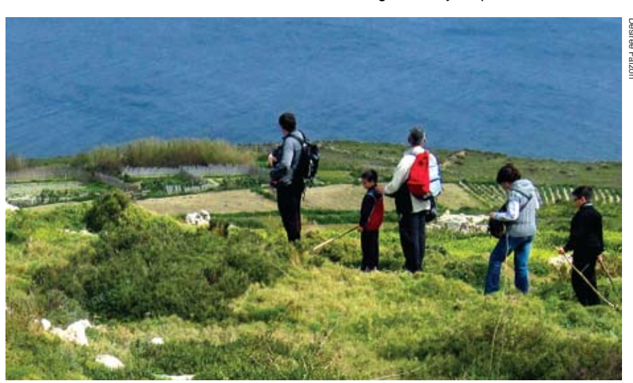
Peace and quiet. Without threatening hunters or loud bangs from shotguns, people will regain possession of the countryside and start to enjoy an outing in spring.

Many birds would nest and breed in Malta if spring hunting did not take place (see box), but people would benefit too. Spring is the most beautiful time of year, but with 10,000 hunters occupying up to 80% of the countryside, most people are too afraid to go out and enjoy it. An end to spring hunting would mean that school groups could visit and study the amazing diversity of plants and animals