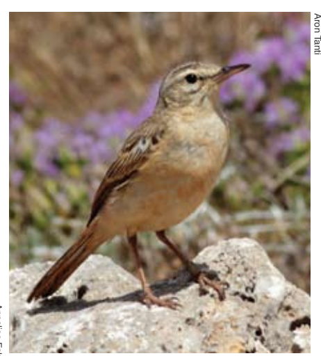
Rare breed. Majjistral is the only known nesting site in Malta for tawny pipit – an irregular breeding bird – in recent years.

advance, and kestrels hover overhead hunting for small rodents. The wide-open landscape allows excellent views of these and many other birds.