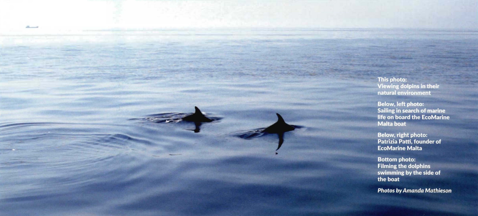
This photo: Viewing dolphins in their natural environment