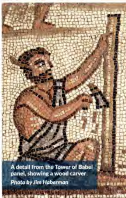
A detail from the Tower of Babel panel, showing a wood carver