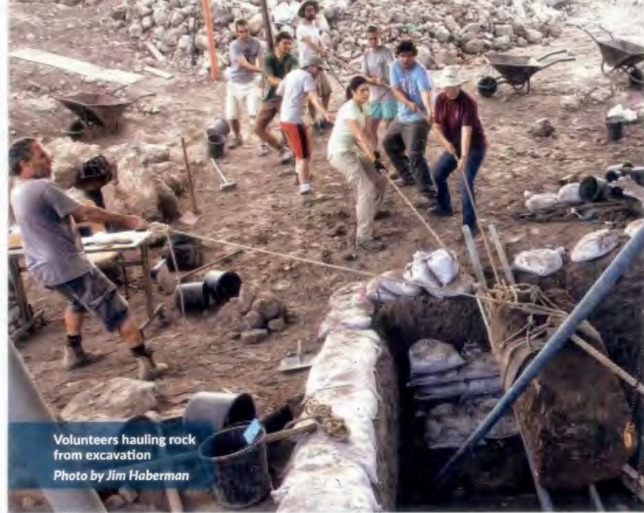
Volunteers hauling rock from excavation

'The mosaics decorating the floor of the Huqoq synagogue revolutionise our understanding of Judaism in this period,' says Magness.