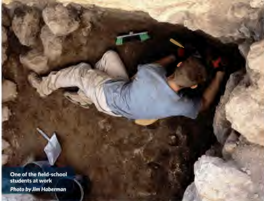
One of the field-school students at work

The discovery of mosaics was unexpected, albeit not completely surprising. We knew that the synagogue was paved with a mosaic floor because of the hundreds of loose tesserae collected as we were going down. But finding loose tesserae is never a good thing! It means that the floor they belonged to has been heavily damaged, if not completely destroyed. So it was rather exhilarating when one fine day in June of 2012, one of the field-school students scraped the hard surface of a mosaic still in situ. Staring straight at him was a face that hadn't seen the light of day in centuries! Since then, summer after summer, the team has exposed one stunning mosaic after another. In contrast to other sites with similar features, the Huqoq mosaics stand out because of their rich, diverse, and exceptional visual content. ▶