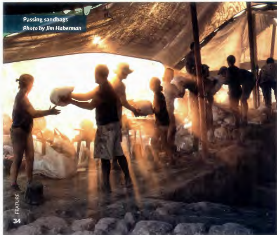
Passing sandbags