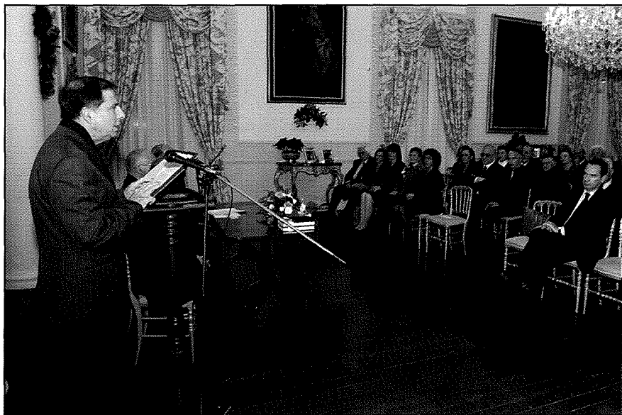
H.E. Dr George Abela, President of Malta, addressing the guests at the Meritorious Historian Award 2010 ceremony.

Just over 240 copies were ordered but, for a Society with 580 members, one would have expected a much larger number of orders.