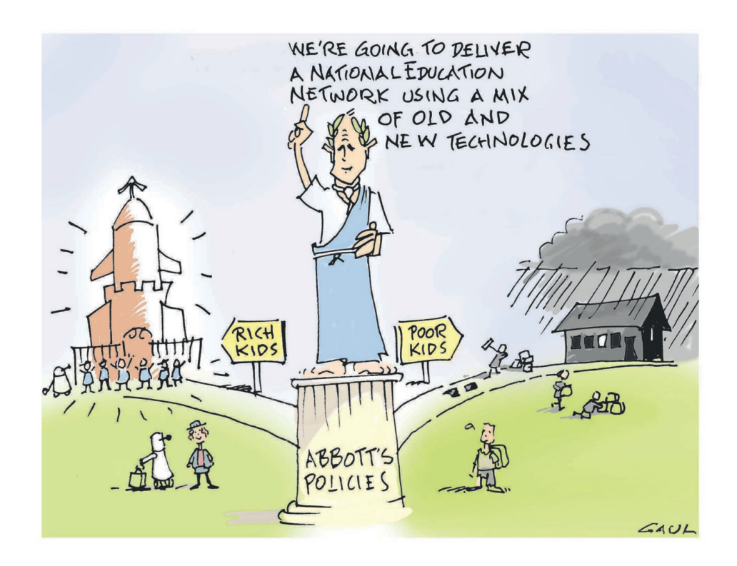
Figure 1 – Political Cartoon by Greg Gaul, produced during the 2016 Federal Election campaign