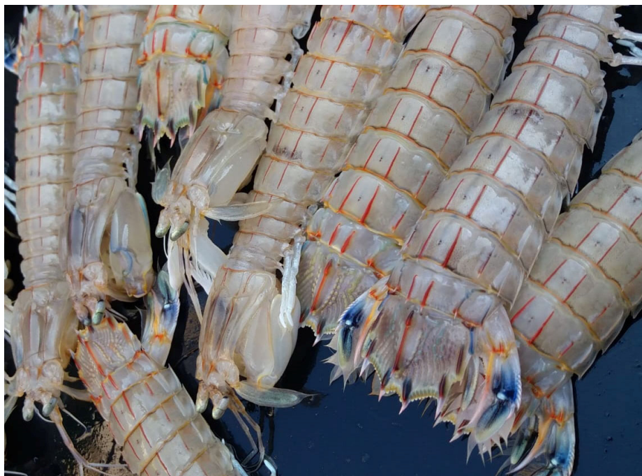
Figure 2. Erugosquilla massavensis (Kossmann, 1880) offered for sale on the Catania fish market, 29 August 2018.

continental shelf and upper slope reveals their capacity to tolerate lower temperatures and this phenomenon has largely been underrated (Galil et al. 2018). It seems that the climatic niche of E. massavensis is wider than accounted for and the species may pose a higher invasion risk in the Central Mediterranean Sea than previously anticipated. Still, it is noteworthy the the average sea surface temperature (SST) in the Gulf of Catania in the months of August and September rose between 2016 and 2018 from 26.34 °C to 26.97 °C and 25.55 °C to 26.46 °C, respectively ( vide A. A. Gauci). Recent records of Erythraean NIS from the Sicilian shelf, such as Siganus rivulatus Forsskål and Niebuhr, 1775 and Trachysalambria palaestinensis (Steinitz, 1932), highlight the increasing vulnerability of Sicily to thermophilic invasive species (Insacco and Zava 2016; Insacco et al. 2017).