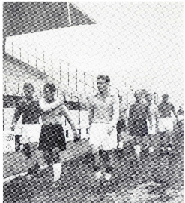
The Malta Youth squad in a training session at the Favorita in Palermo

Before proceeding further with this rather brief account of the chief happenings in the game since it took such a hold on the Maltese public, it is well to record that the fashion of having only British referees officiating in the local game, was done away with when a group of Maltese Knights of the Whistle