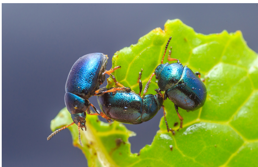
FIGURE 1. Colaphellus palaestinus on Brassica oleracea var. botrytis L.

Global distribution: Apart from the above mentioned territories, C. palaestinus is known to occur also in Egypt (Sinai, Mitla). The species is known from altitudes of -60 m u.s.l. up to more +900 m a.s.l. C. palaestinus is closely related to C. apicalis Ménétrés, 1849, whose distribution is more towards the East (Uzbekistan and Afghanistan). C. palaestinus and C. apicalis can be distinguished by the puncturation and the shape of the aedeagus. In C. apicalis the integument is dull, and head and thoracic puncturation is more distinct. Thoracic and elytral puncturation in C. palaestinus is almost twice as large and more dense than that found in C. apicalis . The apical part of the aedeagus is distinctly pointed and narrower in C. apicalis compared to C. palaestinus .