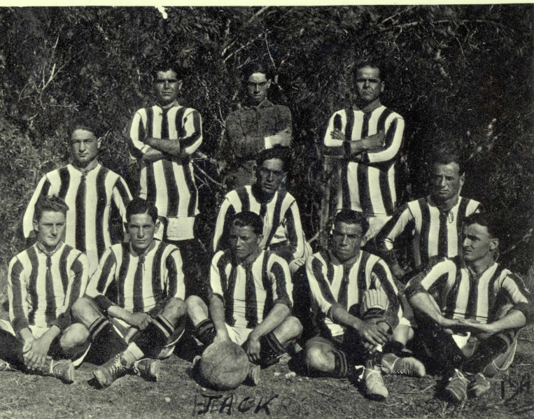
Floriana in Tunis before the match with Racing Club of Tunis. Floriana won 1-0

With protests and abandonments still the order of the day in the M.F.A. League, both Sliema Wanderers and St. George's being suspended to the end of the season for walking out of the field in protest to the referee's decision, public interest reacted with great fervour to the great tussles between what were regarded as the giants of the game.