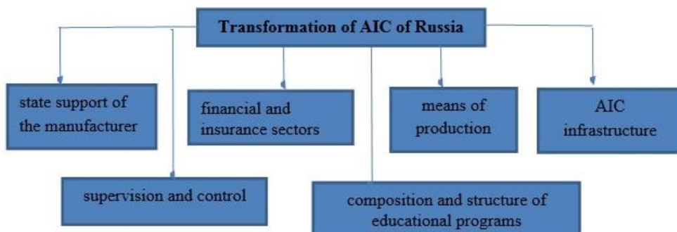
Figure 3. Effects of sectoral transformation

Piloting takes place on a prototype of a public-private platform “digital agriculture” with the participation of the information system of the Analytical Center of the Ministry of Agriculture of the Russian Federation. At the first stage, the participants of the program, together with the Ministry of Agriculture of the Russian Federation, form and ensure the process of determining dynamic seasonal KPIs by sector of agriculture (Abdrakhmanova et al. , 2017; Poltarykhin et al. , 2018a; Poltarykhin et al. , 2018b; Voronkova et al. , 2018).