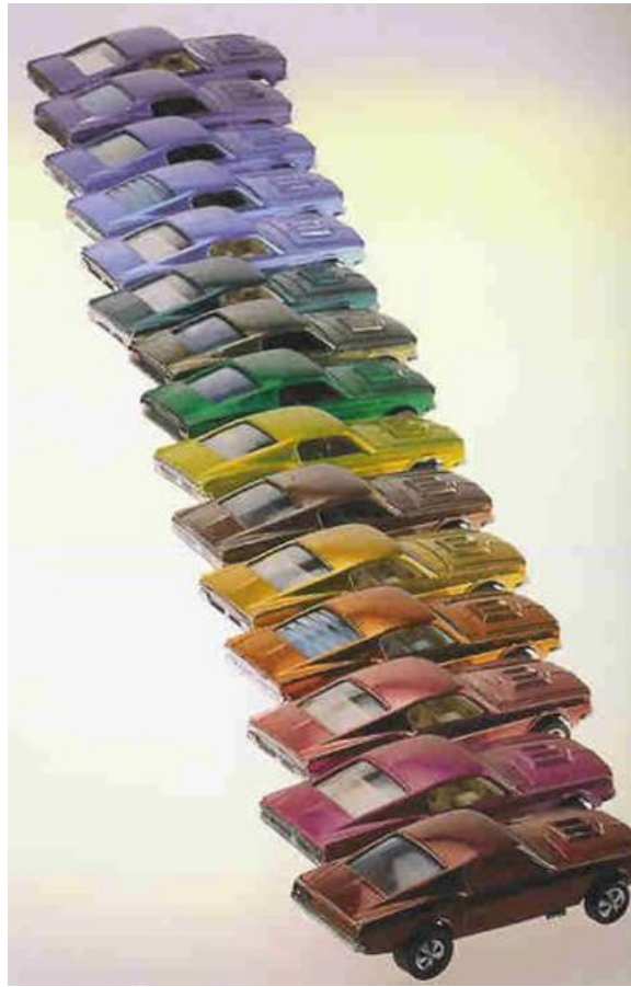
Figure 1: “Cool” Rainbow Cars 9

Michael Benedikt suggests that the beginnings of a style which heralded the computer age had begun to crystallise around a ‘vocabulary of lightness’. 10 1950s and 60s architecture seized upon ‘high-tensile steels, glass, walls reduced to reflective skins, openness, and chromium’ and, by the late 1960s, included the ‘dream of [...] buildings like giant posters bedecked in neons’ and transparent to the communications signals of radio, television, and telephones. 11 These are exactly the qualities which characterise the Hot Wheels cars: metal, gloss, neon. The cars were also soon sporting, like neon billboards shrunk to size, colorful, cartoon-like tampos—angled geometrics, flames in red, silver and black, skulls and crossbones, flaming eyeballs. The entire aesthetic spoke to two primary and related principles: tactility and movement.