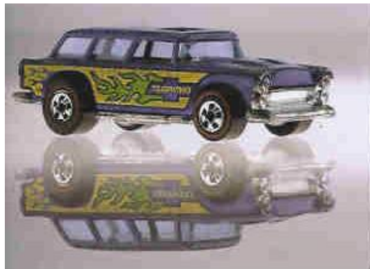
Figure 2: Collectors' Guide: Style 15

It is thus entirely fitting that the Hot Wheels brand has insisted on a signature art and photography style that speaks to the intangible. Official Hot Wheels collector guides simultaneously advertise current models available for purchase and foreground the cars' aesthetic. The guides typically feature a single car on each page, framed by a rectangular border and photographed against a white or silver background that maximises the car's reflection (Figure 2, below). The borders lend the images a portrait-like quality and emphasise a full two degrees of separation from an original—the toy itself as a representation of an automobile (one degree) and the image or portrait of the toy (two degrees). We might add a third degree, since each car appears twice in the images—once as the apparently material subject of the photo, and again as an immaterial reflection. The cars are consistently accompanied by these intangible doubles which flow, like electricity, into and across the negative space of the photograph, reinforcing the intimation of the cars' design: Hot Wheels transcends limits and crosses boundaries.