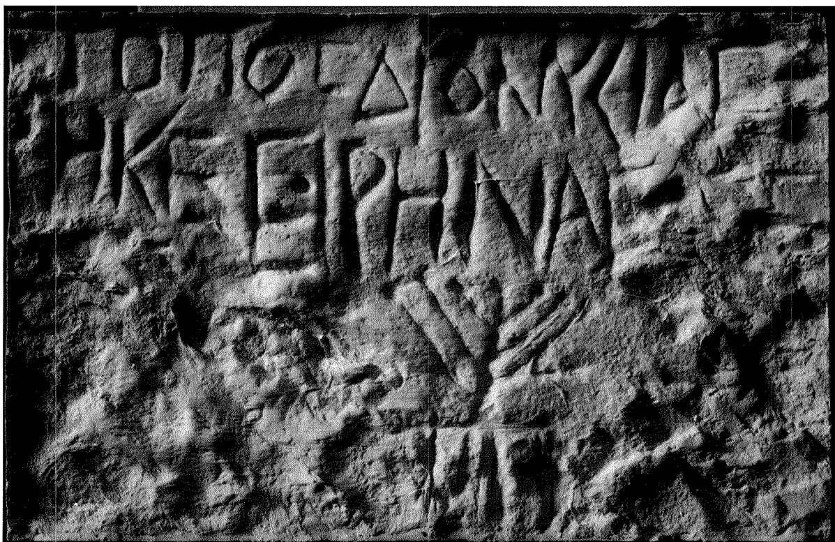
Figure 2. Inscription of Dionisia, also called Eirene

τόπος Διονυσίας ή κέ Ειρήνας ((menorah))