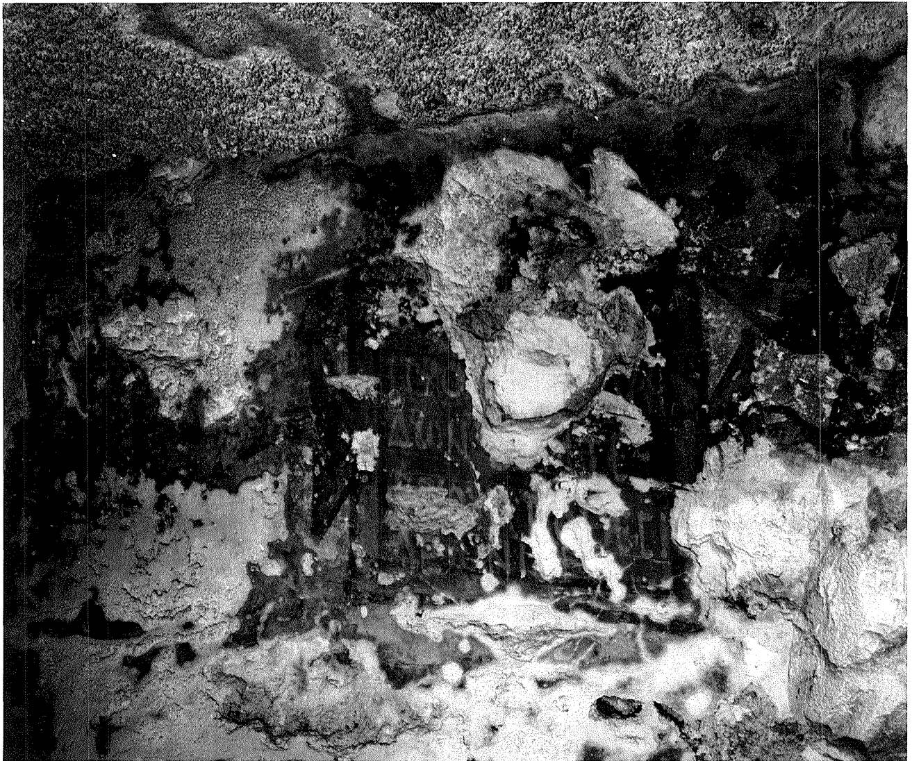
Figure 3. Inscription of Leonias

and recalls the word κοιμητήριον , which can be found in an inscription from Marsa, hypogeum I Jesuits Hill (Buhagiar 2007, 39, no. 33). Within this context, it is interesting to highlight the mention of the purchase of the tomb. According to Carletti, this record is common in inscriptions dated from the middle fourth century AD onwards (Carletti 2008, 97-100), and it is observed in the epigraphic material from San Giovanni Catacombs in Syracuse (Felle 2005, 247). In the Maltese inscription, the word κοιμητήριον with reference to the burial place could be related to Jewish tradition, since it recalls the wording ἐν εἰρήνῃ ἢ κοίμησίς σου , widespread in the Roman Jewish epigraphic formulary (Nuzzo 2005, 113-17). Here is the transcription of the text (Buhagiar 2007, 39, no. 33, re-read by Rizzone 2009, 207):