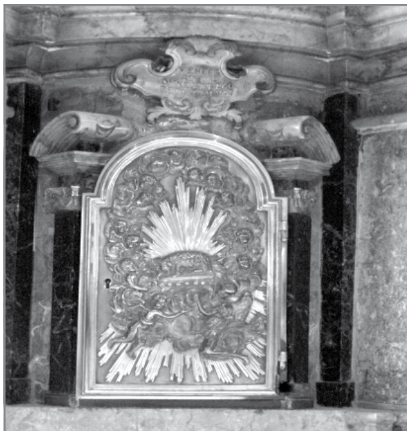
Tabernacle High Altar at St. Philip Parish Church Haż-Żebbuġ 15