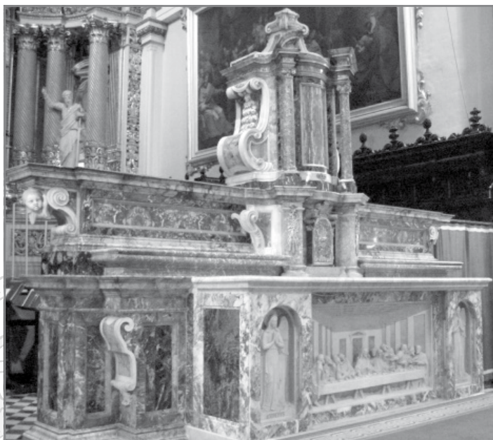
High Altar at St. Philip Parish Church Haż-Żebbuġ 14