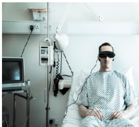
Figure 3: An Empathic Tool from the series Sanctuary (Baldacchino, 2014) exhibited at St. James Capua Hospital, Sliema, Malta.