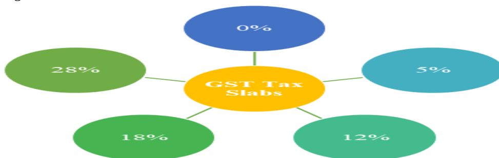
Figure 1. GST rates in India

Essential services and food items have been placed in the lower tax brackets, while luxury services and products have been placed in the higher tax bracket. Government exempted the regular consumption foods like fresh fruits and vegetables, milk, buttermilk, curd, natural honey, flour, bread, etc., from GST for the benefit of masses. Over 1300 goods and 500 services have been classified under four tax slabs of 5%, 12%, 18% and 28% (Figure 1). GST on gold has been kept at 3% and rough precious, diamonds and semi-precious stones is placed at a special rate of 0.25% (Kotak, 2019).