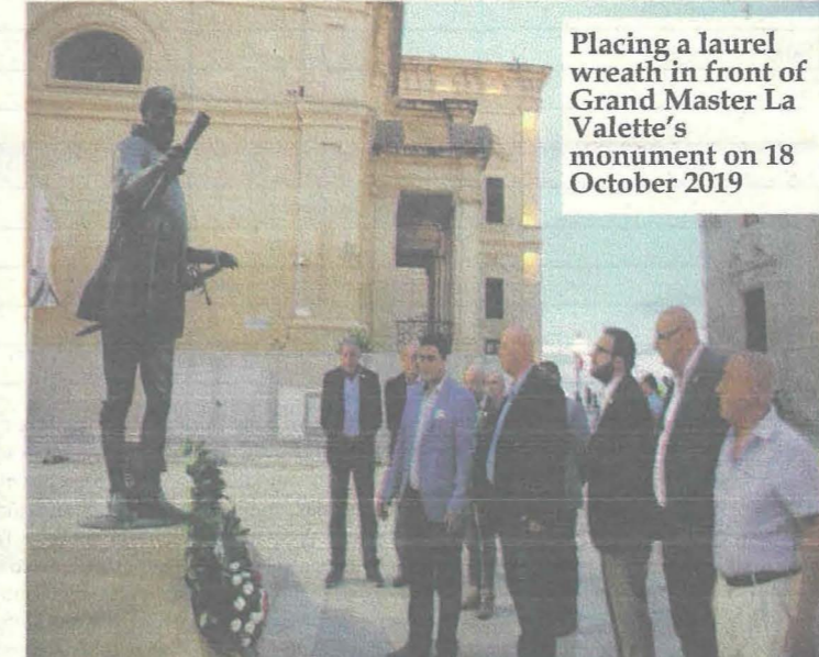
Placing a laurel wreath in front of Grand Master La Valette's monument on 18 October 2019