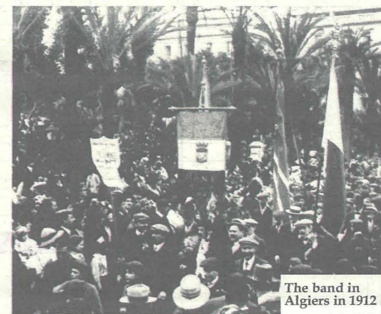
The band in Algiers in 1912