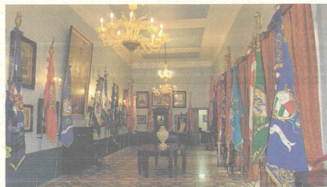
An exhibition of the Standards of musical societies in Malta was held at the band club