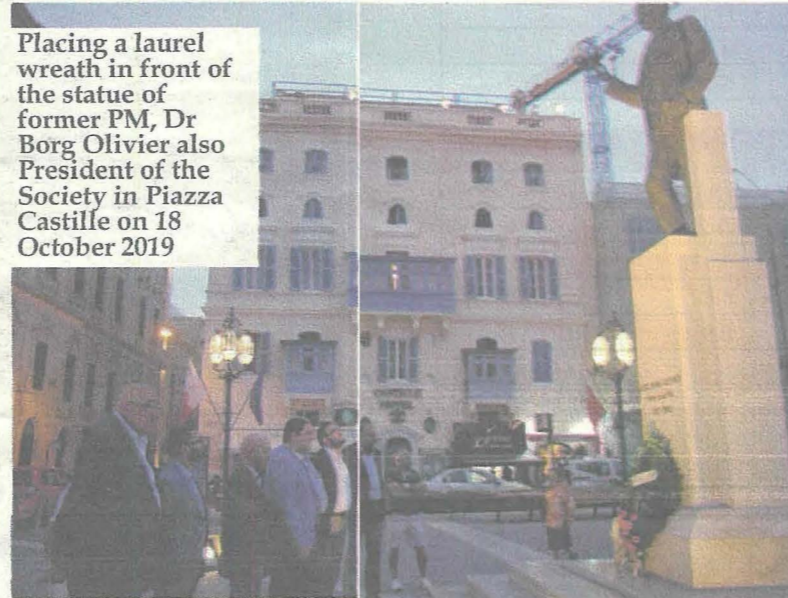
Placing a laurel wreath in front of the statue of former PM, Dr Borg Olivier also President of the Society in Piazza Castille on 18 October 2019