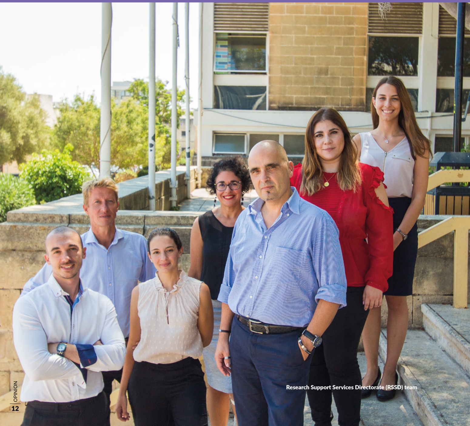
Research Support Services Directorate (RSSD) team