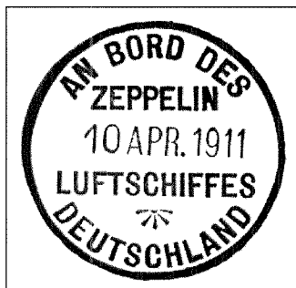
Bordstempel of airship LZ-8 DEUTSCHLAND from 1911

Well, 75 years ago, on 10 April 1936, LZ-129 HINDENBURG arrived back at Friedrichshafen, the airship was returning from the first South America Flight 1936, the first intercontinental trip of the new airship.