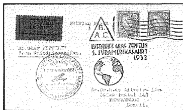
Ireland, 1st South America Flight 1932, one of the 15 recorded covers.

The whole story can be followed here on www.eZEPtalk.de and the listing includes also images of all 15 recorded covers from Ireland. If you have another one in your collection, please report it.