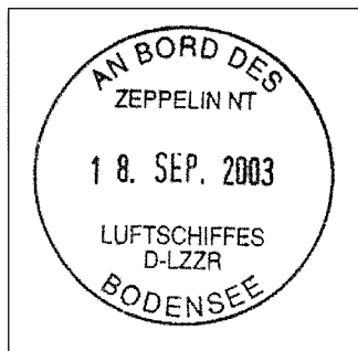
Bordstempel of airship D-LZZR BODENSEE from 2003

The Spring2011 issue of the ZEPPELIN POST JOURNAL is the 100th issue of this publication. And the topic of this jubilee issue is “100” with interesting and fascinating articles about Count Zeppelin’s 100th birthday, LZ-100, flight number 100, 100 dropped pieces, registration number 100, R100 and 100 years Bordstempel, just to mention a few.