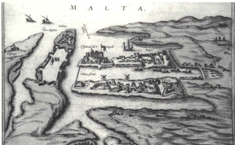
Map drawn after the Great Siege of Malta (1565), showing the fortifications of the Great Harbor and the construction of the new city of Valletta. Georg Braun & Fran Hogenberg, mapmakers, ca. 1600.

The lecture is free and open to the public