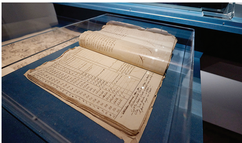
"Journal de la Compagnie de la frégate L'Iris." Malta MS 3. HMML Project Number HMML 00244. 18th century manuscript on paper.

The exhibition commemorated the 50th anniversary of Malta's original proposal for the United Nation's Convention of the Law of the Sea, and was open between February 17 and May 28, 2017. Objects included were loans from over twenty museums, cultural heritage