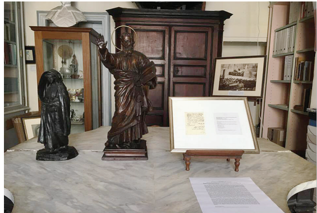
Exhibit for the "Receipt for the Medical Care of a Slave." Archivum de Piro. Box 13. Bundle 7. Item 2, dated 16 November 1726.