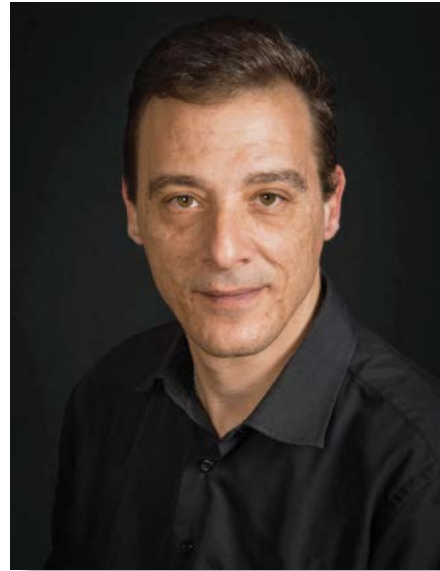
Above: Stephen Busuttill, photographer.

Mr. Busuttill's study revealed the rapid changes the city has undergone since joining the European Union. Photographs of festivals from 2008 and 2018 show the continuing importance of traditions particular to the Catholic heritage of the Maltese islands, including the feasts of saints and carnivals. Scenes of street life in Valletta, however, show the influence of globalization and the increasing role that tourism has played in organizing the daily life and business of the city over the last decade.