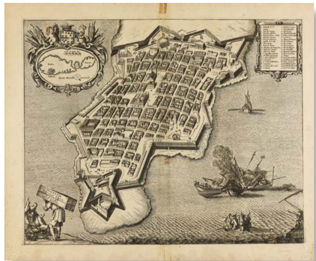
Above: Johannes Janssonius, "Valletta Civitas Nova Maltae olim Militariae" in Theatrum celebriorum urbium Italiae, aliarumque in Insulis Maris Mediterranei . (Amsterdam: Ex Officina Joannis Janssonii, 1657). Printed on paper. HMML project number HMZA 00969.