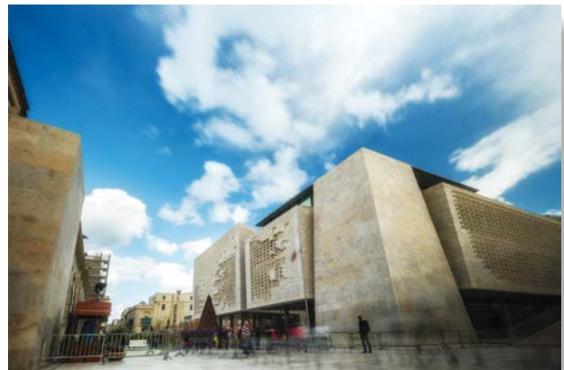
Above: The new Parliament of Malta, photograph by Stephen Busuttill, 2018.

Valletta belt u poplu was a project endorsed by the Valletta 2018 Foundation.