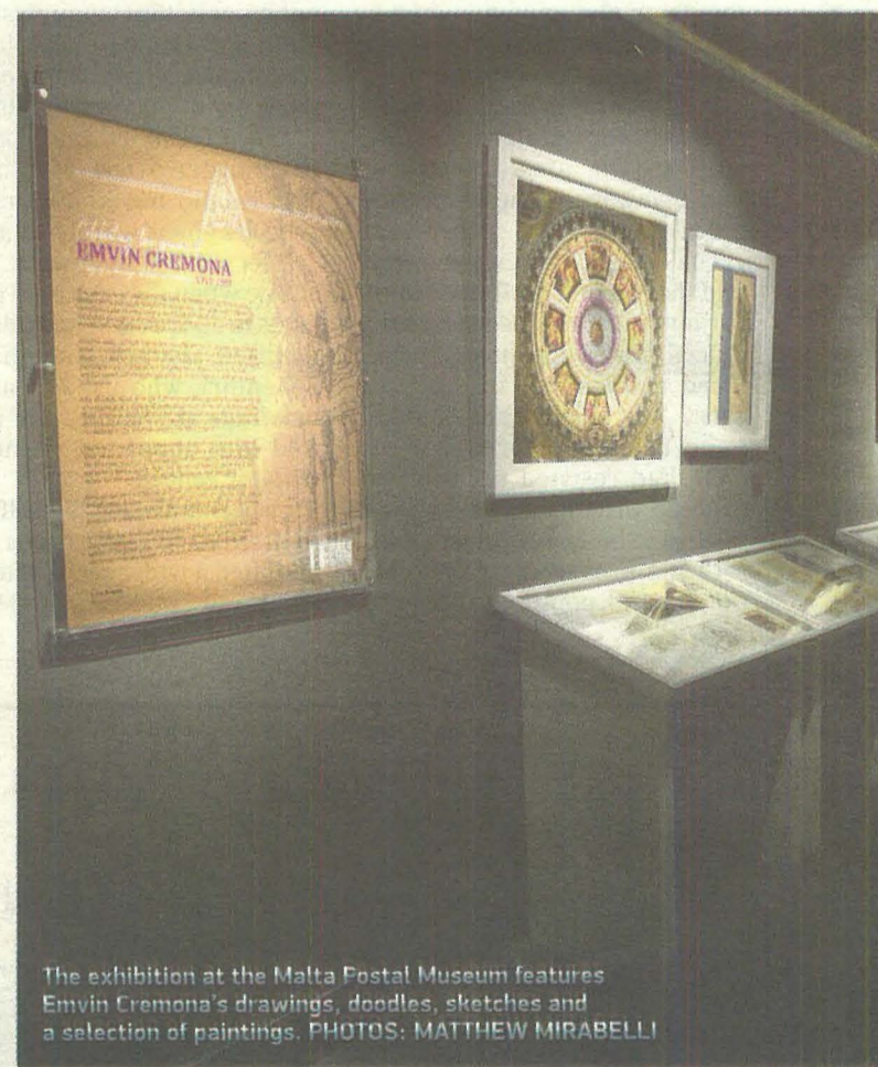
The exhibition at the Malta Postal Museum features Emvin Cremona's drawings, doodles, sketches and a selection of paintings.

It can be safely said that Cremona is one of Malta's foremost 20th-century artists. A formidable name in the