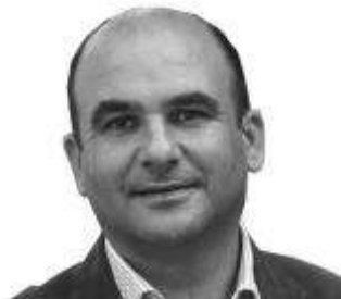
Lack of consultation risks