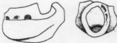
Figure 2 Gz2

Figure 2. Gz2. Also from a marine context: Xlendi Bay. Rim and stem damaged. Gritty micaceous terracotta clay with traces of burnished slip. Bowl and stem almost certainly faceted. Rayed dot decoration at base of rim. This style of pipe became very popular after 1850. It corresponds to Sarachane type X 1 and Varna type 1. Similar pipes have been found at Athens 2 (Robinson A20,21) and Corinth (Robinson C95-99). Also Kastellorizo, Tunis Medina and the Auberge de Castile, Valletta 3 .