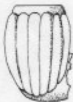
Figure 3 Gz3

Figure 2. Gz2. Also from a marine context: Xlendi Bay. Rim and stem damaged. Gritty micaceous terracotta clay with traces of burnished slip. Bowl and stem almost certainly faceted. Rayed dot decoration at base of rim. This style of pipe became very popular after 1850. It corresponds to Sarachane type X 1 and Varna type 1. Similar pipes have been found at Athens 2 (Robinson A20,21) and Corinth (Robinson C95-99). Also Kastellorizo, Tunis Medina and the Auberge de Castile, Valletta 3 .