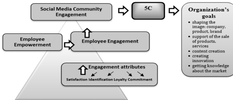
Figure 1. The relationship between employee engagement and the effectiveness of achieving the company's goals with the engagement of the social media community.