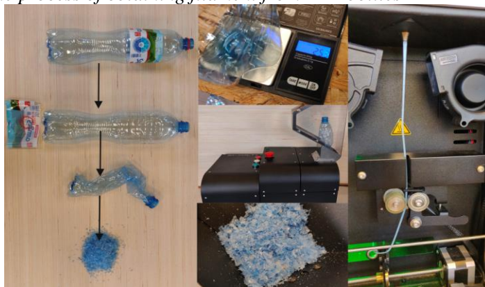
Figure 2. The process of obtaining filament from PET bottles

An important element in the distribution of the helmets was the communication between the helmet manufacturer and institutions where there was a demand. In a pandemic situation, communication via mobile phones and e-mail was primarily