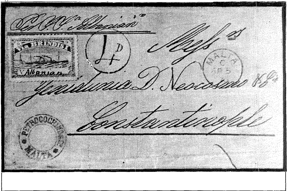
Fig. 3 VIA BRINDISI (N° 9). Cover from Malta to Constantinople, Via Brindisi, per Albanian. April, 1875. Illustrated in MSC Handbook.

Round the four margins, in microscopic characters, runs the legend: "Vignettes postals Zimmerli, auteur-editeur, Agence maritime contracts forfaits, Delfosse et Cie, 24 Rue des Ecuries, maison reccomandee pour transports". I apologize for any misinterpretation, but the extreme smallness of the legend, invisible to the naked eye, makes the letters difficult to decipher.