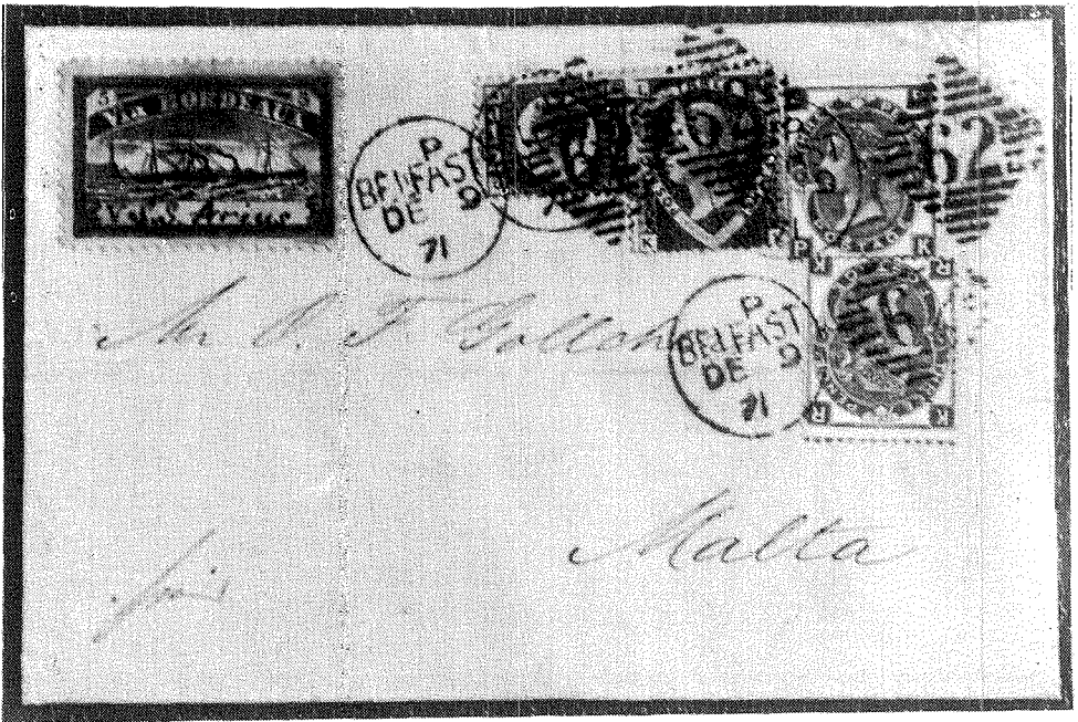
Fig. 1 VIA BORDEAUX (N° 5). Entire from Belfast to Malta, via Bordeaux, per S.S. Arius . December, 1871.

These labels measure c. 36 x 25, perforation 11. Each routing is printed in a distinctive colour, and the number of each "via" is prominently displayed near the two upper corners. A blank slot at the bottom allows the ship's name to be filled in manuscript.