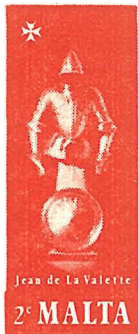
Grand Master Jean De La Vallette