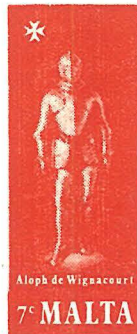
Grand Master Aloph De Wignacourt