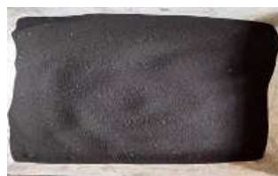
Figure1 Foundry Sand

Foundry Sand is a waste material obtained from casting industries obtained from the casting of ferrous and non-ferrous metals. Foundry Sand is used as a partial replacement with fine aggregates to investigate the optimum utilization percentage in the concrete mix. The utilization of FS is not only helpful to reduce the carbon emissions in the production of concrete but also helpful for minimizing waste and preparation of greener concrete. In the present study, FS is used from Bhoparai Metals Pvt. Punjab-Mohali-India (Bhimani, et al. 2013).