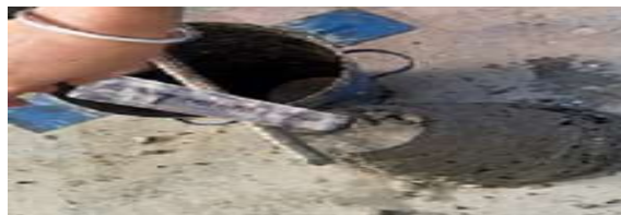
Figure 3 Figure for slump test

This study test is conducted to check the workability for concrete Mix 1, concrete Mix 2 and conventional concrete. Test results shown in Table 3 indicate that the test values obtained for concrete Mix 2 in which 25% replacement of FS with fine aggregates and 30% replacement of GGBS with cement shows higher workability of 110 mm when compared to other trials mixes and slump for conventional concrete.