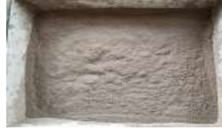
Figure 2 Ground Granulated Blast Furnace Slag

GGBS in the concrete mix is helpful to reduce the heat of hydration effect. In addition, the study indicates that usage of GGBS in optimum percentages is responsible for increased strength and is beneficial for enhancing other properties of concrete, like workability and durability (Karri et.al, 2015).