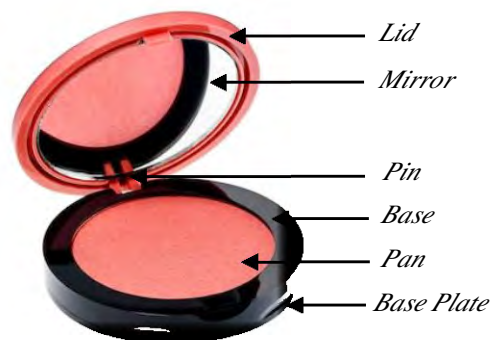
Figure 1. Tivoli cosmetic blush compact.

2.1.2. Functional Unit. It is critical to establish a clear functional unit when carrying out an LCA study, as this is a quantitative measure of the function of the system being studied and allows for fair 'like with like' comparisons [12]. In this case, the cosmetic blush powder is estimated to last around 18 - 24 months from when it is first opened. Through surveying 20 cosmetic blush users, it was found that a 3.5g cosmetic pan approximately lasts for around 100 uses [13]. If the user uses the blush once a day (i.e. 1 day = 1 use), the user will require approximately four cosmetic pans in one year (365 days). Moreover, the probability that the user will not keep buying pan refills or may wish to change brand increases after 1 year. Therefore, the functional unit for this study was taken to be the usage of cosmetic powder in the period of one year, thus defining the functional unit as the usage of 14g (3.5g x 4 uses) of cosmetic blush powder. This will allow the output quantity of cosmetic powder to always remain constant, whilst being able to compare different versions of compact cases in a fair method.