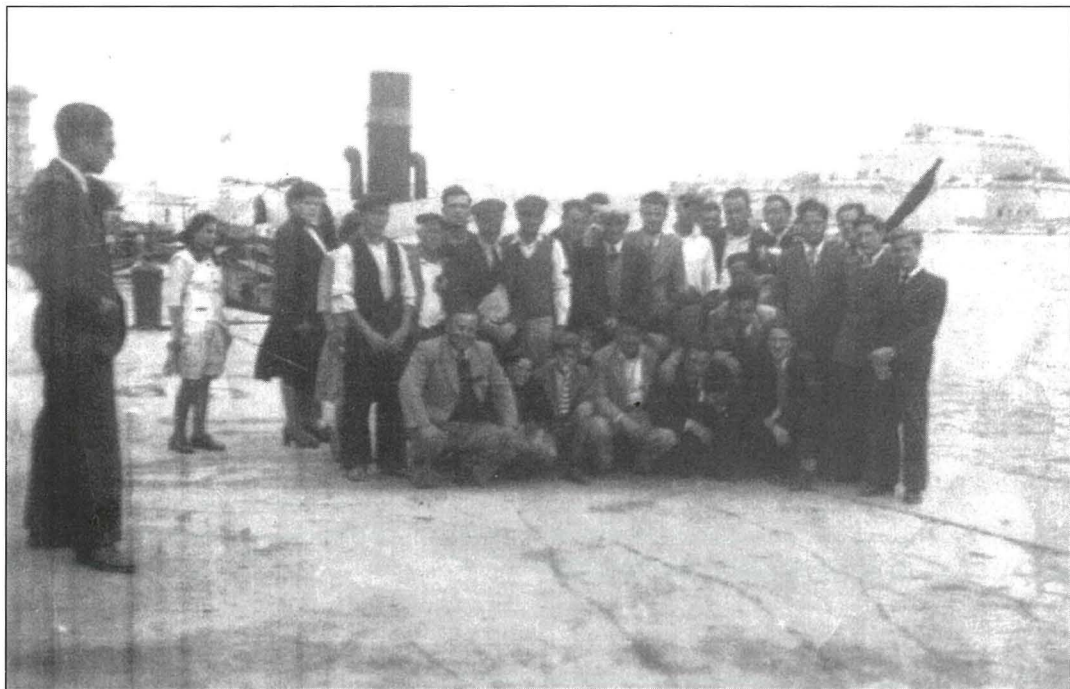
Grupp ta' minn 11al Luqa flimkien mal-familjari tagħhom fid-Dwana tal-Belt qabel ma' mbarkaw fuq il-vapur.

Dak iż-żmien, Malta kienet għadha kolonja Ngliza, u sfortunatament ma tantx kien hawn xogħol għall-Maltin. Ħafna min-nies kienu bdiewa. Ohrajn kellhom xi negozju żgħir, u wħud jaħdmu d- Dockyard jew mas-servizzi Nglizi. Futur għal uliedhom ma