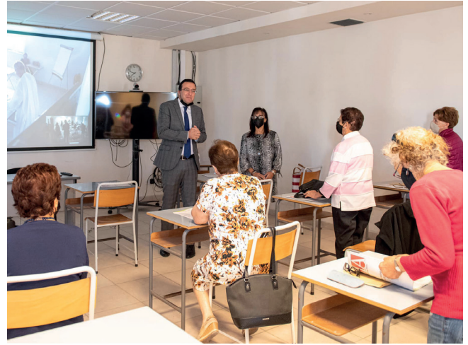
Minister for Gozo Clint Camilleri addressing the audience.