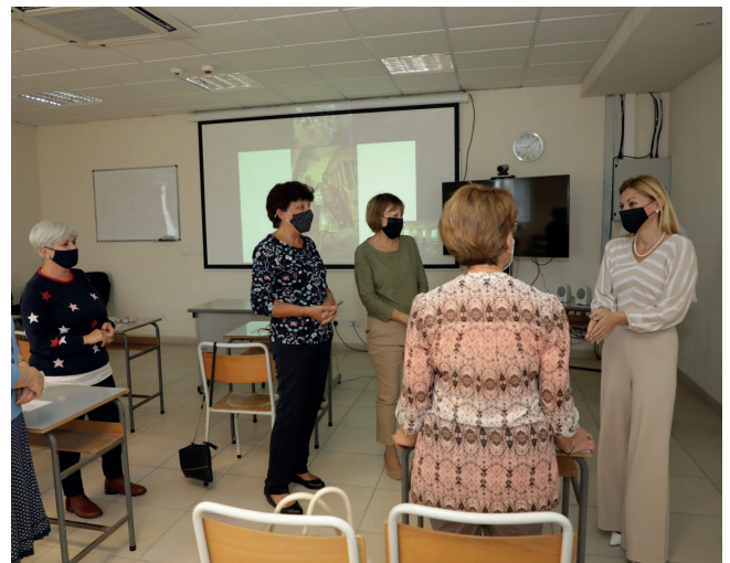
Hon. Dr Justyne Caruana with U3A participants.

On 22nd October, Minister for Education, Hon. Dr Justyne Caruana, paid a courtesy visit to the University Gozo Campus as part of a series of visits at various educational institutions across Malta and Gozo. During her visit the Minister had the opportunity to meet with the students following the U3A classes.