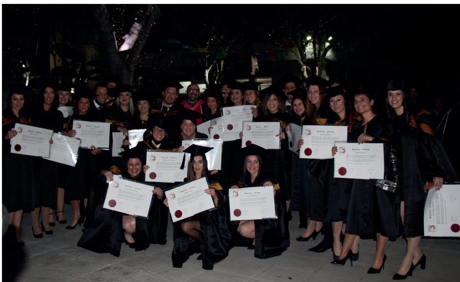
The graduates in the Bachelor of Arts (Honours) in Facilitating Inclusive Education.