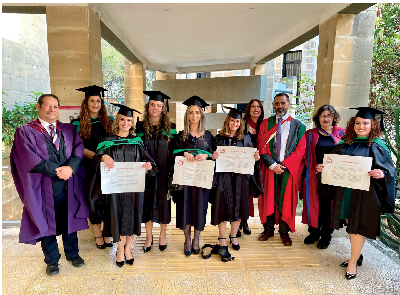
The six graduates who successfully completed the Bachelor of Psychology (Hons.) at the Gozo Campus.