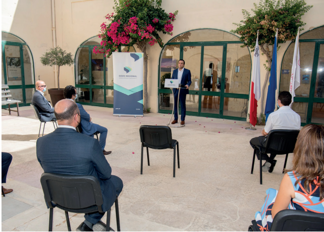
Minister for Gozo Clint Camilleri addressing the press conference during the scholarship launching.

During a press conference held at the Gozo Campus, Minister Camilleri said that in a changing world that is becoming more globalised, it is important that as a country we are competitive and offer the best human talent by having a workforce that is academically qualified, creative, and open to change.