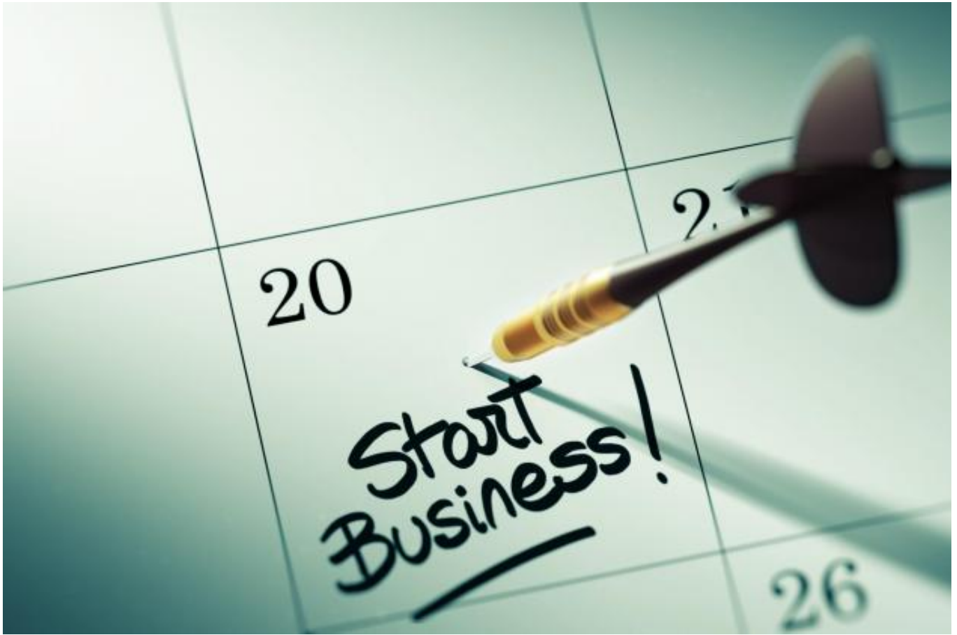
Choosing the right time to start your business