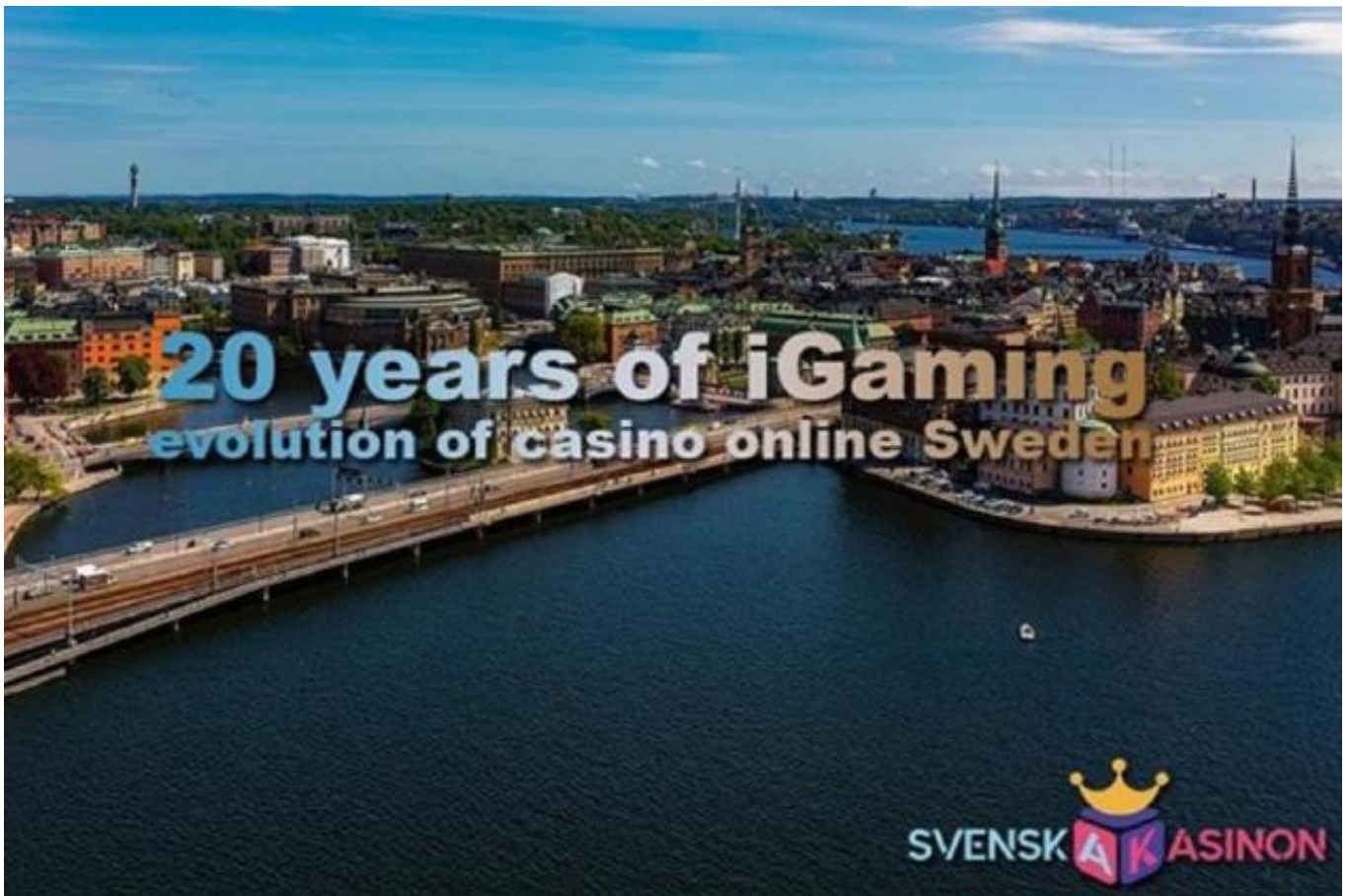
20 years of iGaming: evolution of casino online Sweden