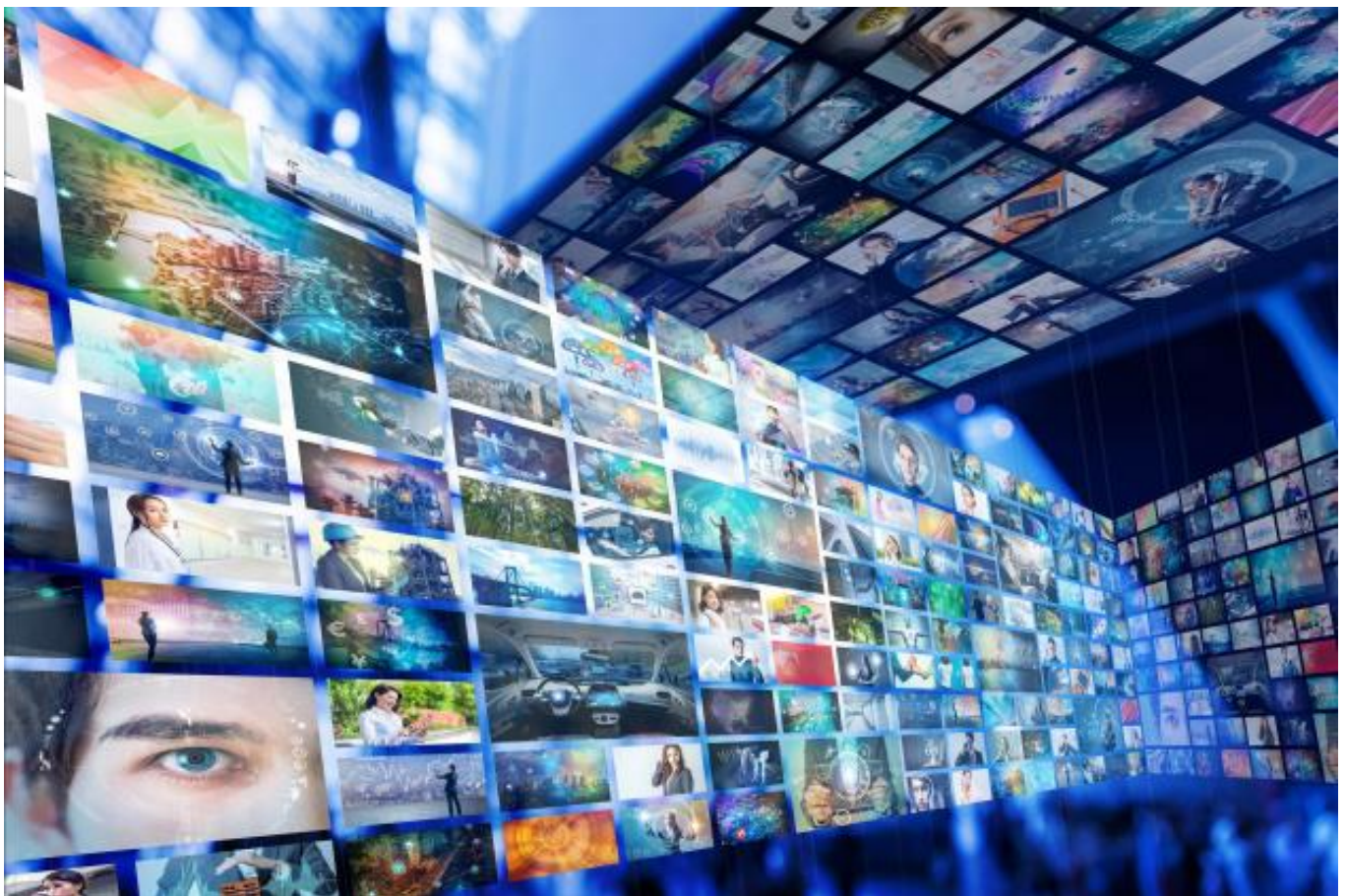
Look DS makes exciting announcements at Look Event – Autumn Edition