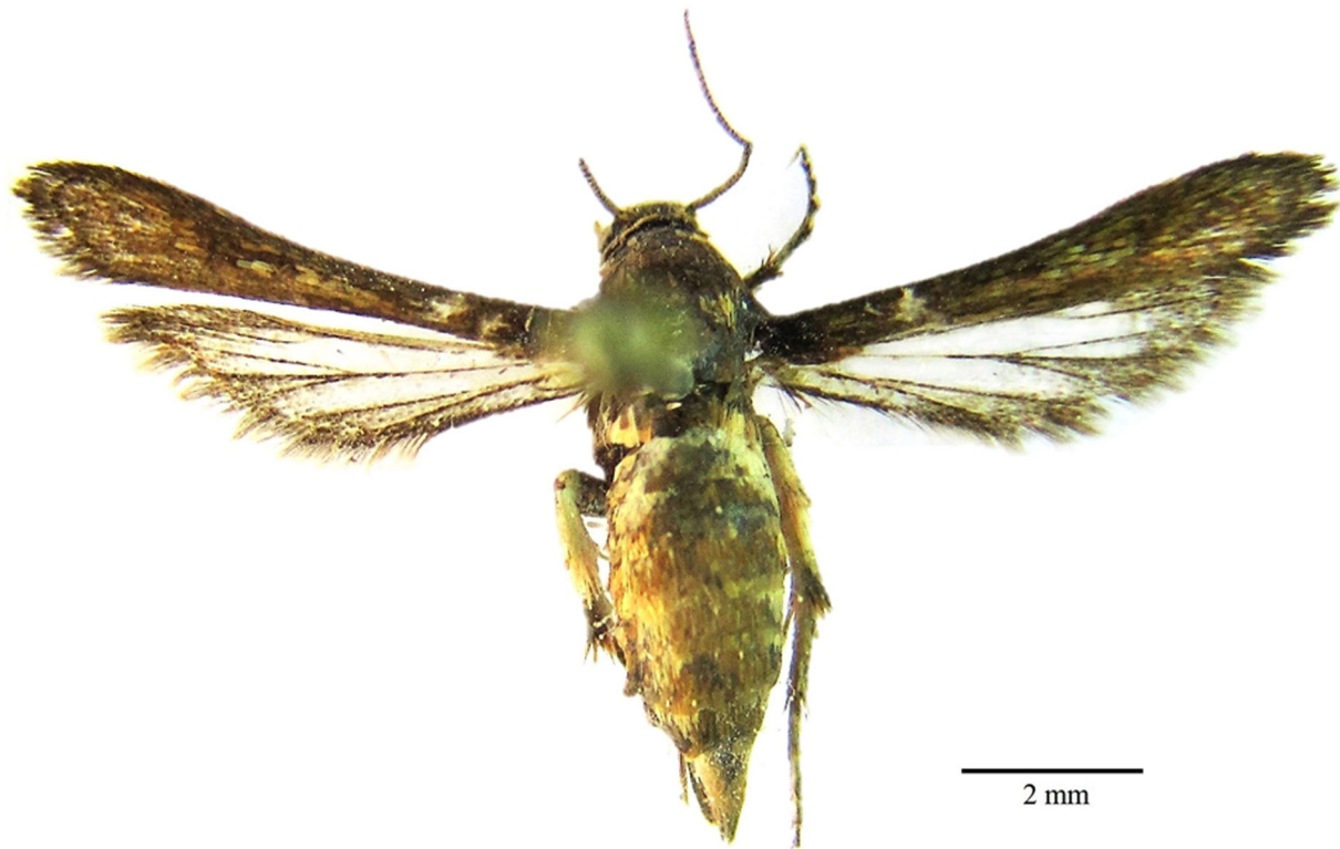
Figure 2. Dorsal photograph of Tinthia tineiformis (voucher ID SESDM001) collected from Malta.

on a 1.5% agarose gel stained with ethidium bromide, together with a 100 bp DNA ladder (Solis BioDyne, Estonia). Each of the remaining PCR product was subsequently purified and sequenced in both directions with an ABI3730XL sequencer. Quality check, editing, and assembly of complementary barcode sequences was conducted in Geneious® 11.1.2 ( https://www.geneious.com ; Kearse et al. 2012). The final COI sequence of 619 bp was searched against NCBI GenBank® database (GenBank, https://www.ncbi.nlm.nih.gov/genbank ; Benson et al. 2012) nucleotide collection (nr/nt) using BLASTn v. 2.9.0 (Zhang et al. 2000; Morgulis et al. 2008). The 619 bp sequence was also searched against the species level barcode records available at the Barcode of Life Data System (BOLD, http://www.boldsystems.org ; Ratnasingham and Hebert 2007). The COI sequence data of the specimen was deposited to GenBank (MK803278).