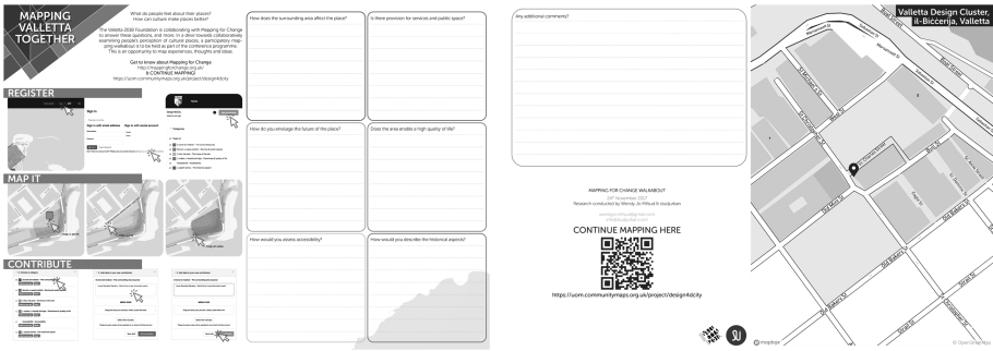
Fig. 2. Sample of paper map used by PPGIS participants during the mapping exercise carried out in one of the four Valletta neighbourhoods, the Biccierja.

The participants were broadly briefed on these themes as well as the importance of their open-ended participation in data gathering. Limiting the themes to be observed by the participants provided more definitive responses that could be free of any influence and bias from the project coordinators. Following the PPGIS walkabout the hundreds of collected responses were digitised and mapped (Fig. 3). Around a third of the participants were able to map their observations during the walkabout immediately onto the online platform and most of them also used the paper mapping method; thereby combining both physical and digital participatory mapping. The session ran for around an hour and enabled the participants to engage with the coordinators and fellow participants, as well as with members of the public. It was observed that although the physical map provides a context for discussion, participants are not always easily adapted to the technology. Those who faced challenges with Internet access carried out the mapping manually on paper.